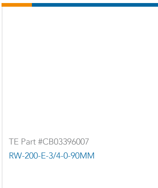
TE Part #CB03396007 RW-200-E-3/4-0-90MM