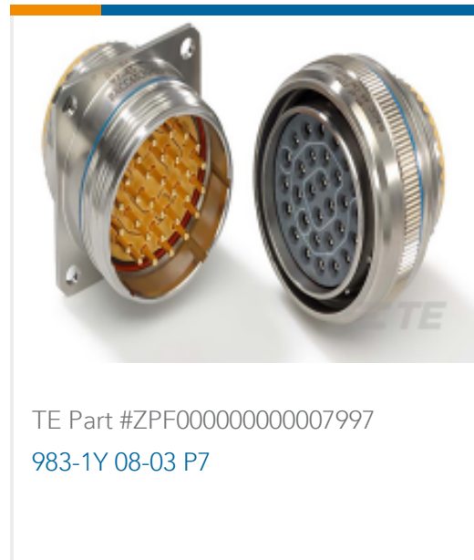
TE Part #ZPF000000000007997 983-1Y 08-03 P7