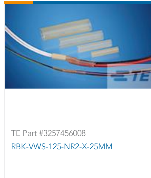
TE Part #3257456008 RBK-VWS-125-NR2-X-25MM