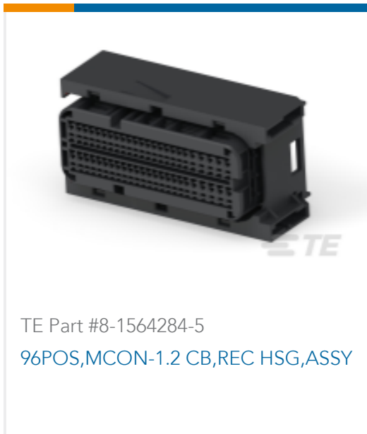
TE Part #8-1564284-5 96POS,MCON-1.2 CB,REC HSG,ASSY