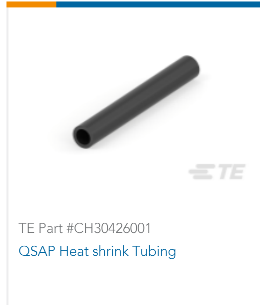
TE Part #CH30426001 QSAP Heat shrink Tubing