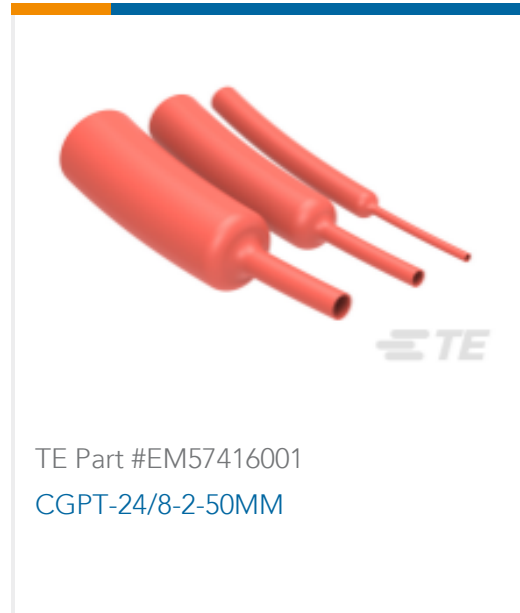
TE Part #EM57416001 CGPT-24/8-2-50MM