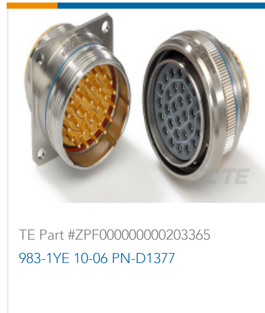
TE Part #ZPF000000000203365 983-1YE 10-06 PN-D1377