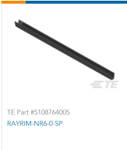
TE Part #5108764005 RAYRIM-NR6-0-SP