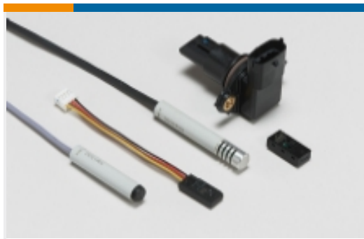
Humidity Sensor Assemblies(4)