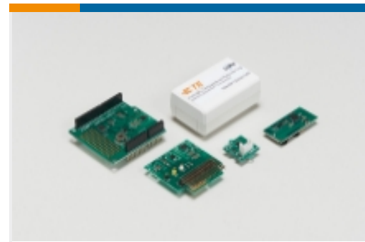
Sensor Development Boards and Evaluation Kits(3)