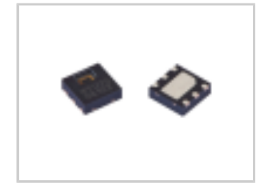
HTU20DF RH/T SENSOR W. FILTER