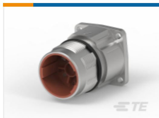
TE Part # BEA116N00000200000 923 RECEPTACLE, SPEEDTEC-READY