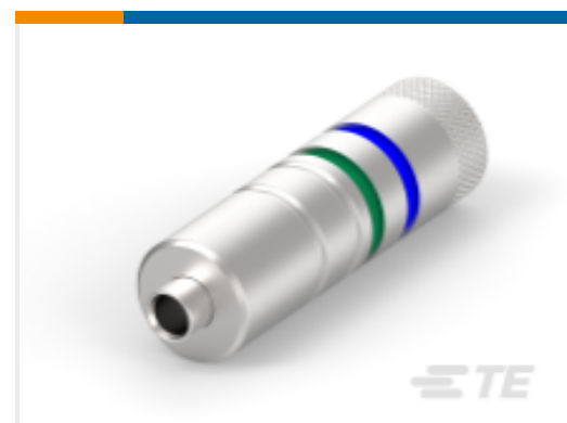
TE Part # C0-0004-000-000 POSITIONING INSERT FOR 2 MM CONTACTS