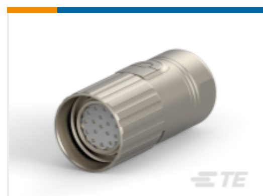
TE Part #ASA014F01400235000 623 PLUG