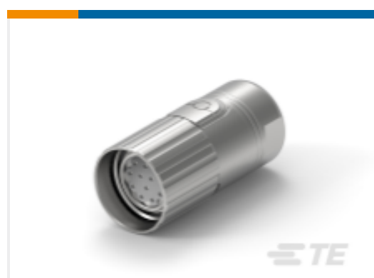
TE Part #ASA012N00410235000 623 PLUG