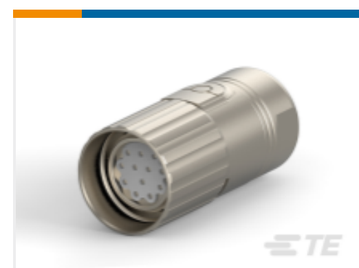
TE Part #ASA020N00410235000 623 PLUG