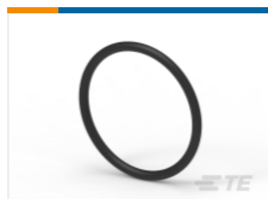
TE Part #81-0006-090-000 O-RING 18 X 1,5