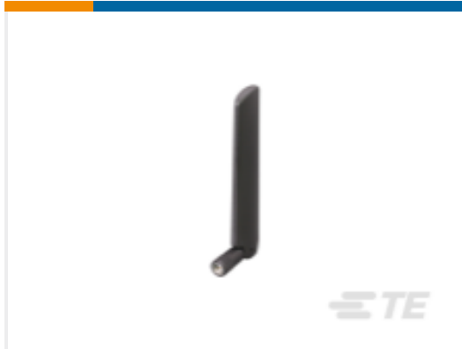
TE Part #ANT-W63WS5-SMA Antenna Blade Wifi6/6E Swivel SMA