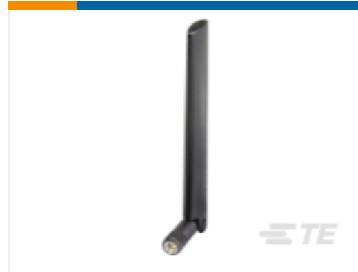
TE Part #ANT-W63WS3-SMA Antenna Blade Wifi6/6E Swivel SMA