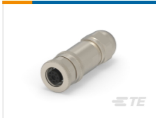
TE Part #T4110012041-000 M12 F, 4P GOLD A_CODE S SHIELDED PG9