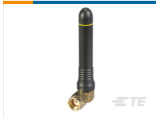
TE Part #ANT-916-CW-RCS Antenna 1/4 Wave R-Angle 916MHz RPS