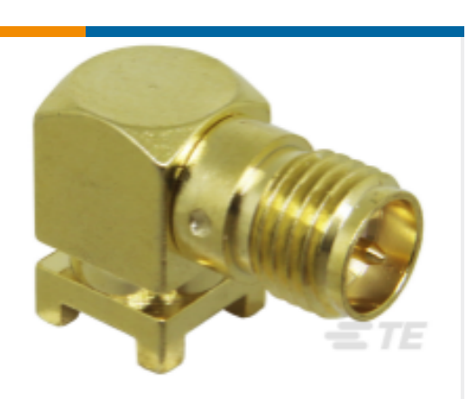
TE Part # CONREVSMA002-SMD-G RP-SMA RA Jack 50 Ohm PCB Surface Mount