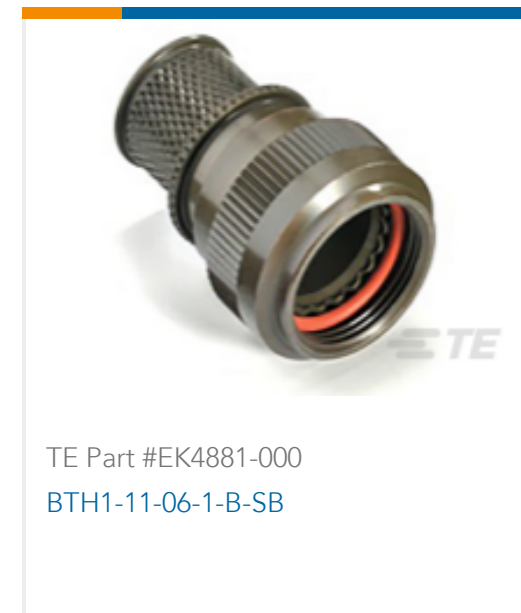
TE Part #EK4881-000 BTH1-11-06-1-B-SB