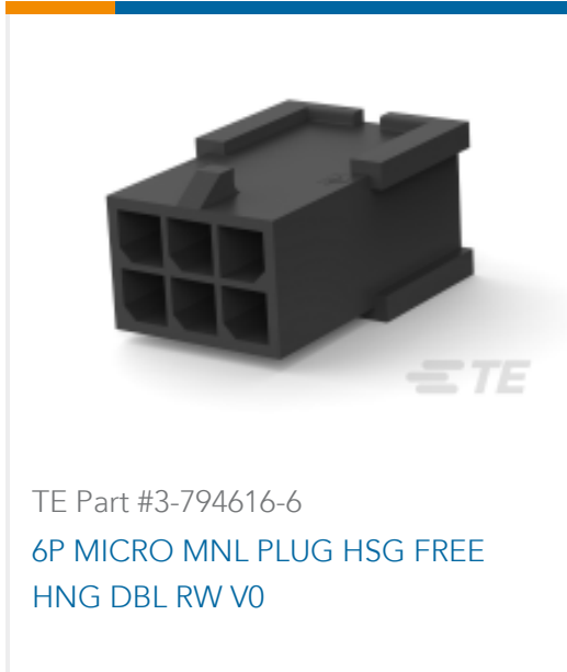
TE Part #3-794616-6 6P MICRO MNL PLUG HSG FREE HNG DBL RW V0