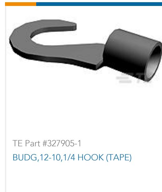
TE Part #327905-1 BUDG, 12-10, 1/4 HOOK (TAPE)