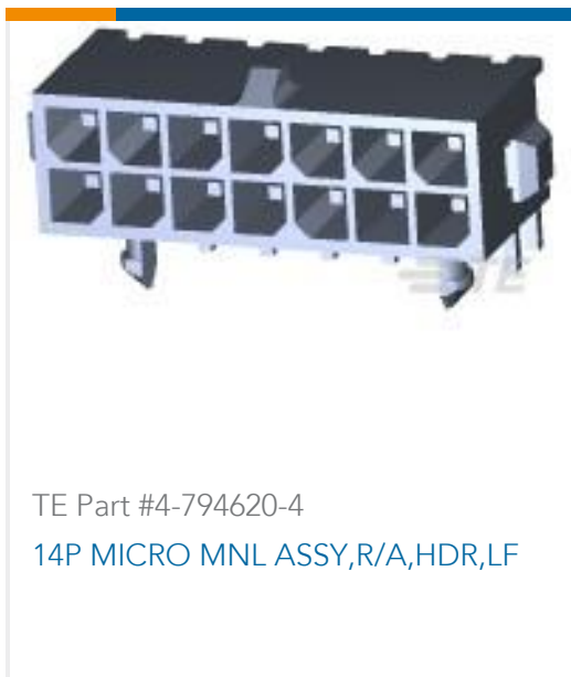
TE Part #4-794620-4 14P MICRO MNL ASSY, R/A, HDR, LF