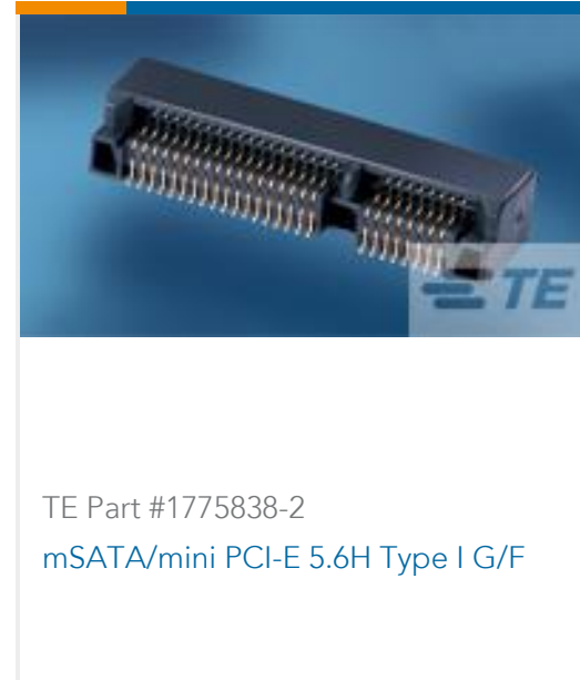
TE Part #1775838-2 mSATA/mini PCI-E 5.6H Type I G/F