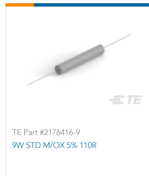
TE Part #2176416-9 9W STD M/OX 5% 110R