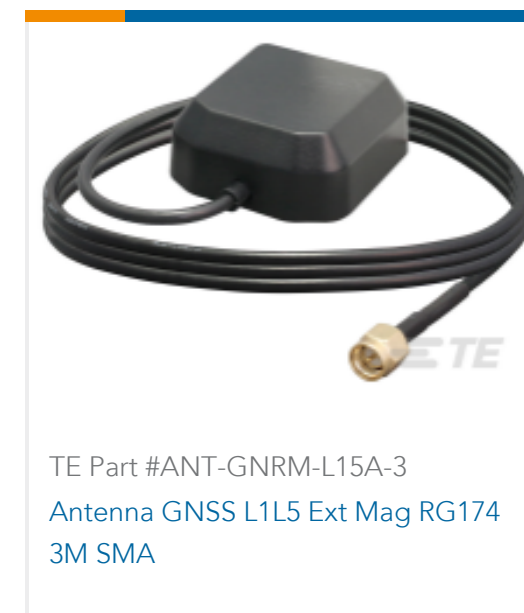
TE Part #ANT-GNRM-L15A-3 Antenna GNSS L1L5 Ext Mag RG174 3M SMA