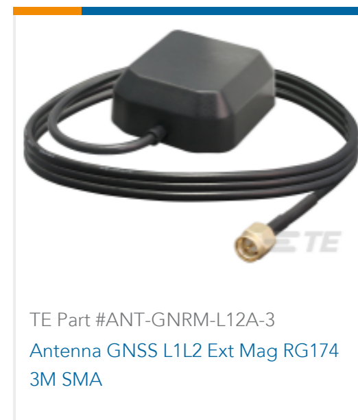
TE Part #ANT-GNRM-L12A-3 Antenna GNSS L1L2 Ext Mag RG174 3M SMA