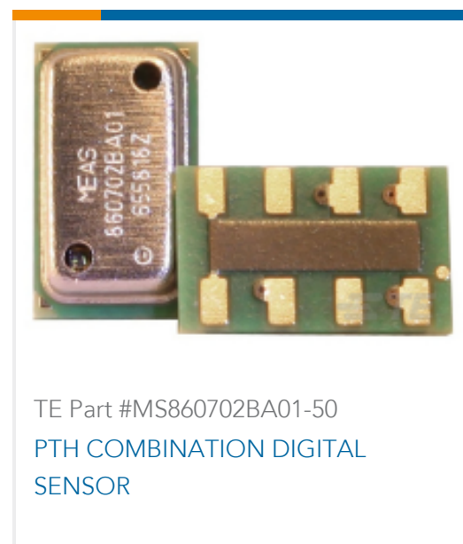
TE Part #MS860702BA01-50 PTH COMBINATION DIGITAL SENSOR