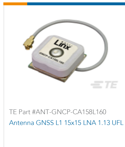
TE Part #ANT-GNCP-CA158L160 Antenna GNSS L1 15x15 LNA 1.13 UFL