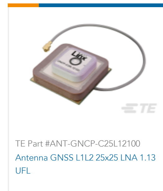
TE Part #ANT-GNCP-C25L12100 Antenna GNSS L1L2 25x25 LNA 1.13 UFL