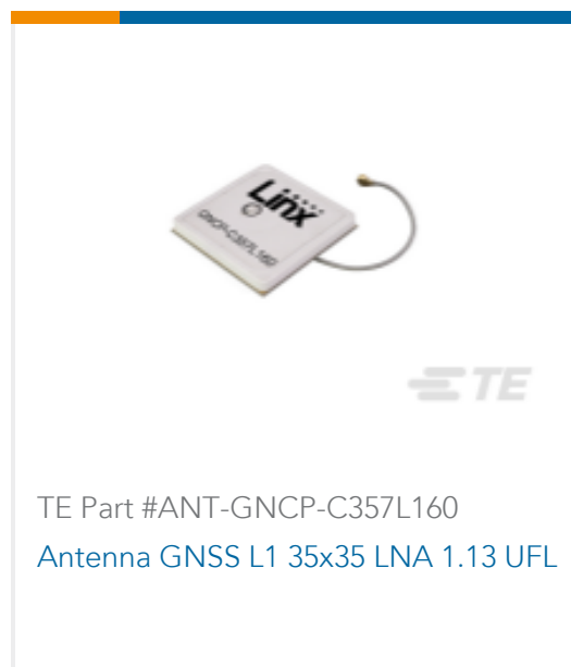
TE Part #ANT-GNCP-C357L160 Antenna GNSS L1 35x35 LNA 1.13 UFL