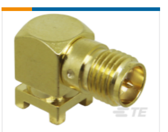
TE Part # CONREVSMA002-SMD-G RP-SMA RA Jack 50 Ohm PCB Surface Mount