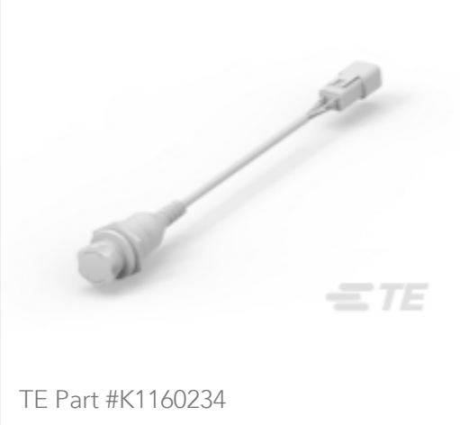
Emergency Switch ES-2002-T311-020B