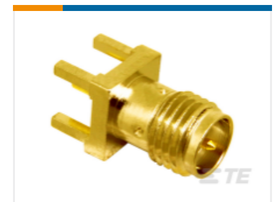
TE Part # CONREVSMA001-G RP-SMA Jack 50 Ohm PCB Through Hole