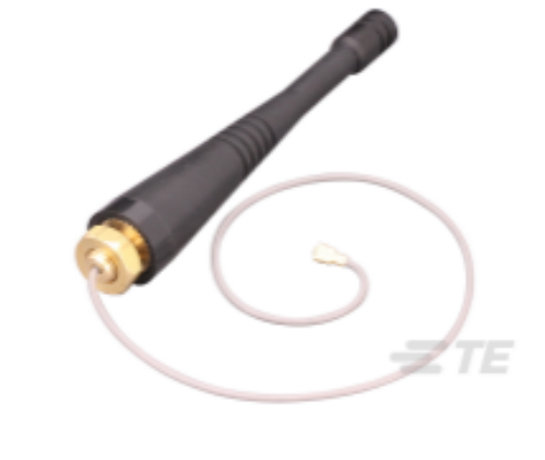
TE Part #ANT-B5-PW-QW-UFL Antenna 1/4 Wave Whip LTE B5 1.32 UFL