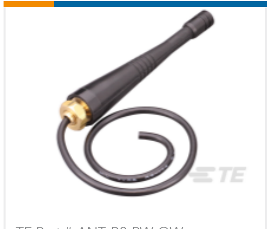
TE Part # ANT-B8-PW-QW Antenna 1/4 Wave Whip LTE B8 RG174