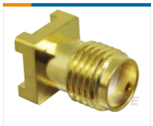
TE Part #CONSMA001-SMD-G-T SMA Jack 50 Ohm PCB Surface Mount