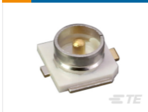
TE Part # CONMHF1-SMD-T U.FL/MHF1 Jack 50 Ohm PCB Surface Mount