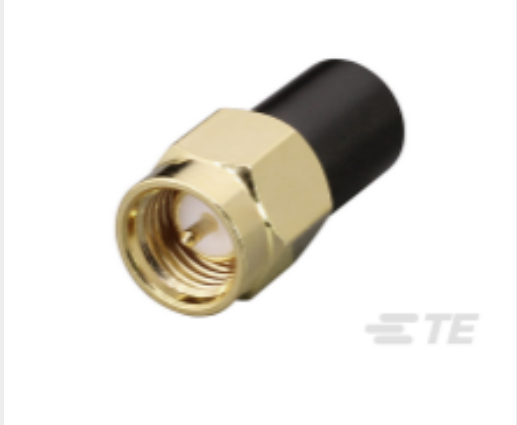
TE Part #ANT-915-NUB-SMA Antenna Short 915 SMA Jack