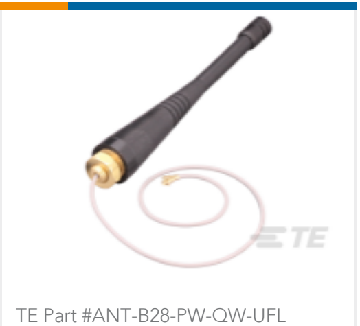
Antenna 1/4 Wave Whip LTE B28 1.32 UFL