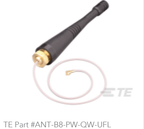
TE Part #ANT-B8-PW-QW-UFL Antenna 1/4 Wave Whip LTE B8 1.32 UFL