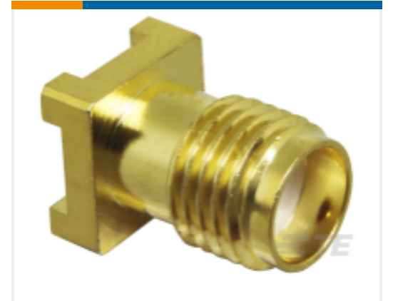
TE Part #CONSMA001-SMD-G-T SMA Jack 50 Ohm PCB Surface Mount