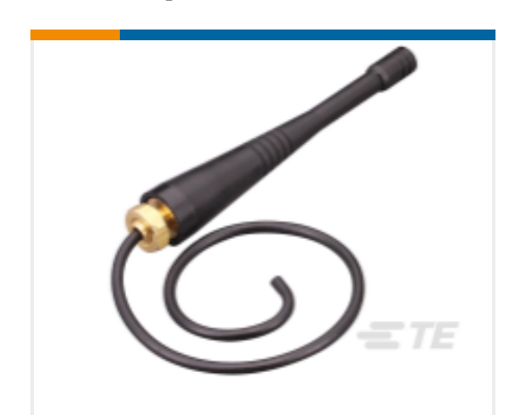
TE Part # ANT-B28-PW-QW Antenna 1/4 Wave Whip LTE B28 RG174