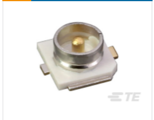
TE Part # CONMHF1-SMD-T U.FL/MHF1 Jack 50 Ohm PCB Surface Mount