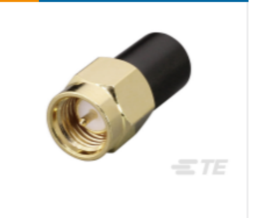
TE Part #ANT-915-NUB-SMA Antenna Short 915 SMA Jack