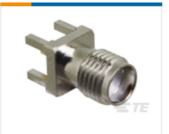
TE Part # CONSMA001 SMA Jack 50 Ohm PCB Through Hole