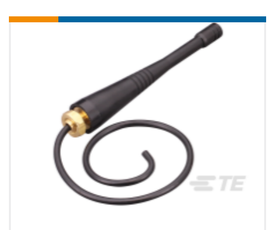
TE Part # ANT-B28-PW-QW Antenna 1/4 Wave Whip LTE B28 RG174