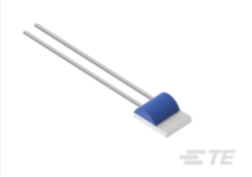
TE Part #NB-PTCO-011 Pt100, 2.0x2.3, Class A, PTFC101A1G0