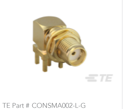
TE Part # CONSMA002-L-G SMA Jack 50 Ohm PCB Through Hole