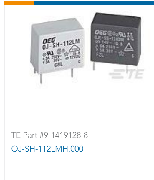
TE Part #9-1419128-8 OJ-SH-112LMH,000