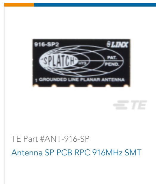
TE Part #ANT-916-SP Antenna SP PCB RPC 916MHz SMT