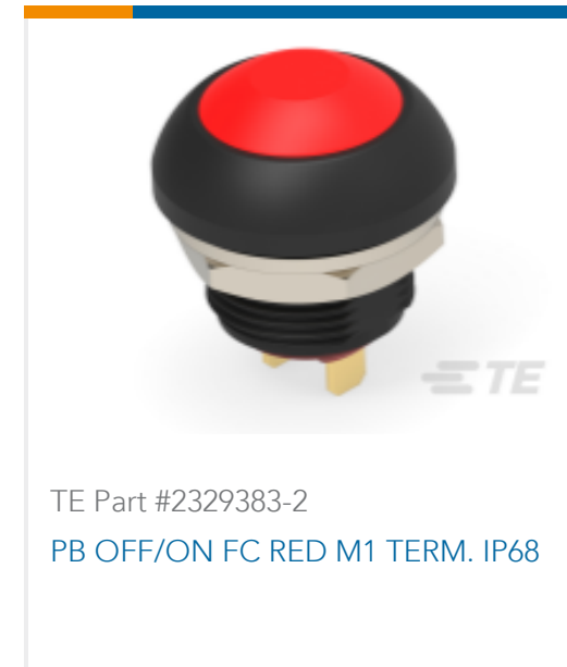
TE Part #2329383-2 PB OFF/ON FC RED M1 TERM. IP68