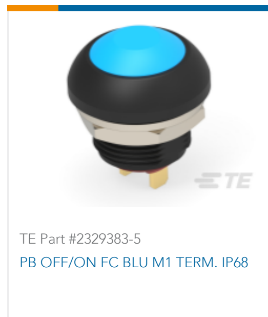
TE Part #2329383-5 PB OFF/ON FC BLU M1 TERM. IP68