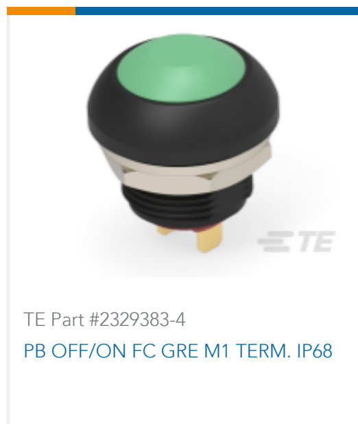
TE Part #2329383-4 PB OFF/ON FC GRE M1 TERM. IP68