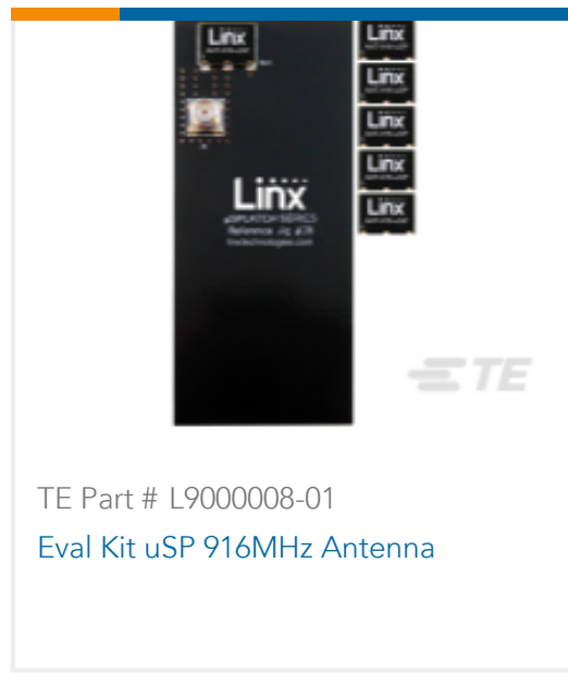
TE Part # L9000008-01 Eval Kit uSP 916MHz Antenna