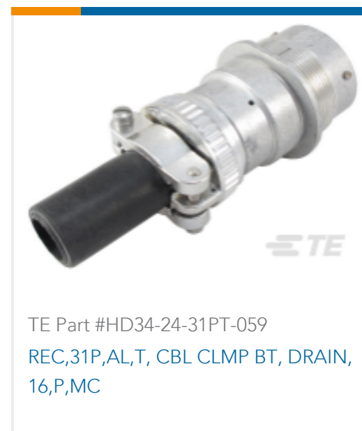
TE Part #HD34-24-31PT-059 REC,31P,AL,T,CBL CLMP BT, DRAIN, 16,P,MC