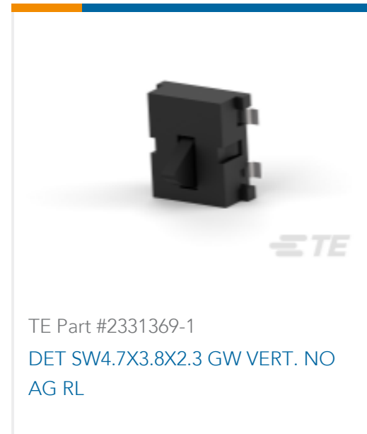
TE Part #2331369-1 DET SW4.7X3.8X2.3 GW VERT. NO AG RL