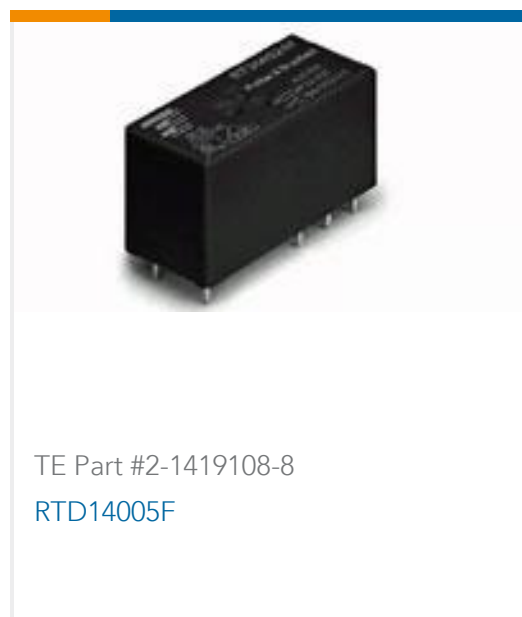
TE Part #2-1419108-8 RTD14005F