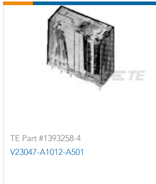
TE Part #1393258-4 V23047-A1012-A501