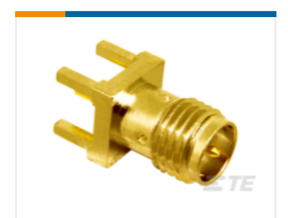
TE Part # CONREVSMA001-G RP-SMA Jack 50 Ohm PCB Through Hole