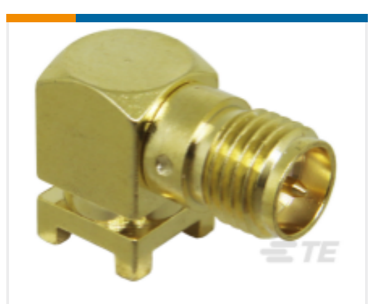
TE Part # CONREVSMA002-SMD-G RP-SMA RA Jack 50 Ohm PCB Surface Mount