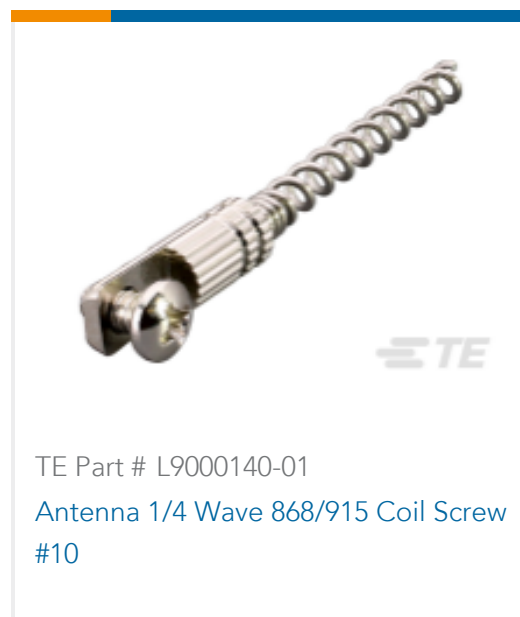
TE Part # L9000140-01 Antenna 1/4 Wave 868/915 Coil Screw #10