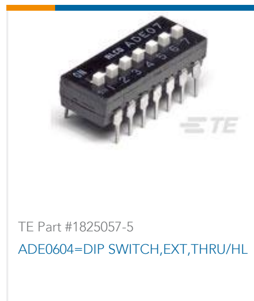
TE Part #1825057-5 ADE0604=DIP SWITCH,EXT,THRU/HL