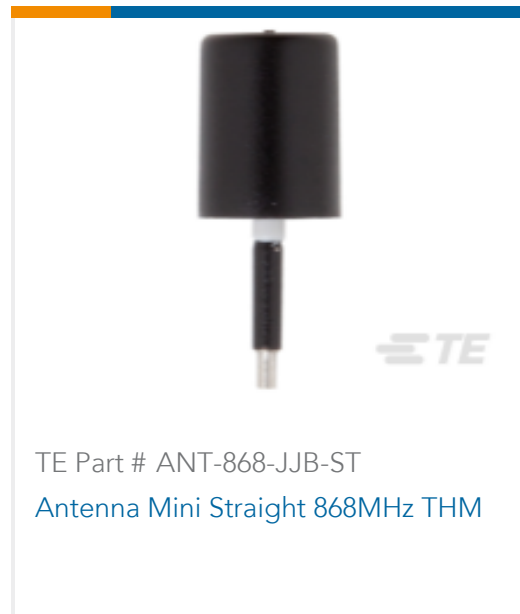
TE Part # ANT-868-JJB-ST Antenna Mini Straight 868MHz THM