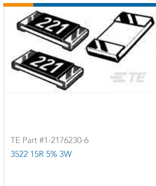
TE Part #1-2176230-6 3522 15R 5% 3W