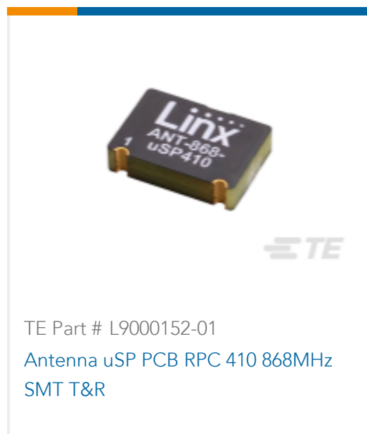
TE Part # L9000152-01 Antenna uSP PCB RPC 410 868MHz SMT T&R