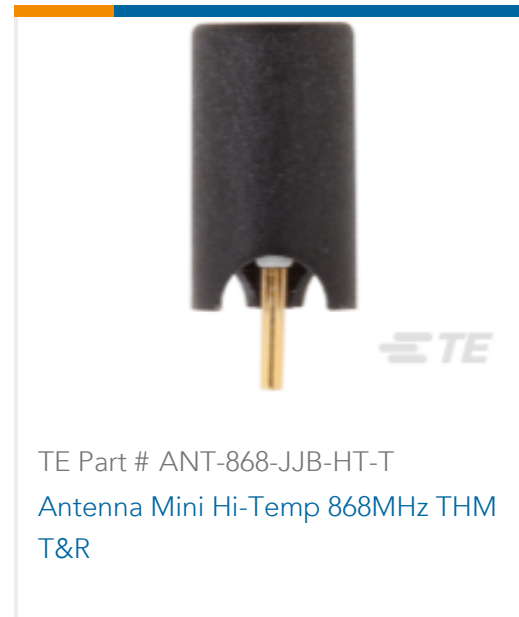
TE Part # ANT-868-JJB-HT-T Antenna Mini Hi-Temp 868MHz THM T&R