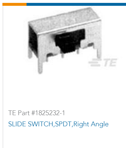
TE Part #1825232-1 SLIDE SWITCH,SPDT,Right Angle