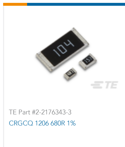
TE Part #2-2176343-3 CRGCO 1206 680R 1%