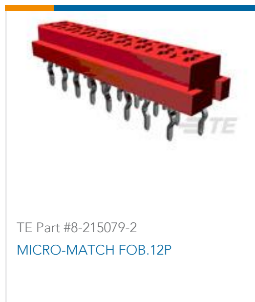
TE Part #8-215079-2 MICRO-MATCH FOB.12P