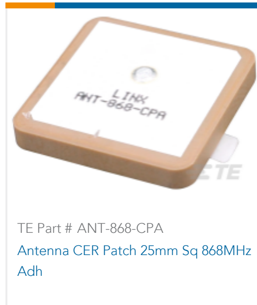
TE Part # ANT-868-CPA Antenna CER Patch 25mm Sq 868MHz Adh