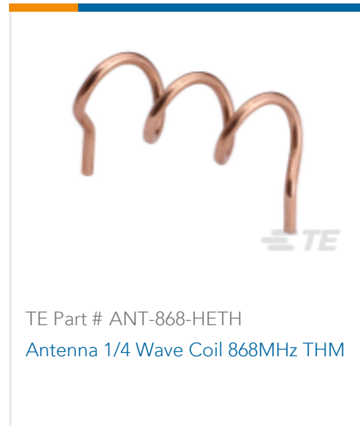
TE Part # ANT-868-HETH Antenna 1/4 Wave Coil 868MHz THM