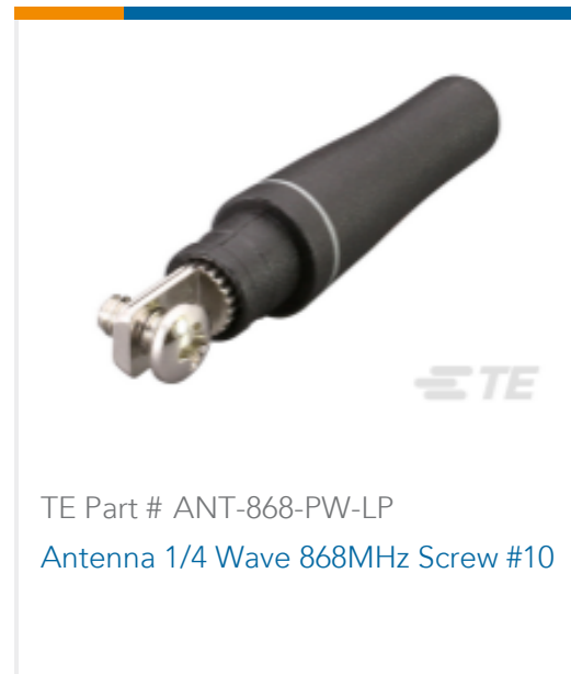
TE Part # ANT-868-PW-LP Antenna 1/4 Wave 868MHz Screw #10