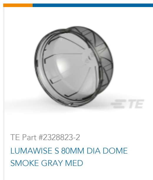
TE Part #2328823-2 LUMAWISE S 80MM DIA DOME SMOKE GRAY MED