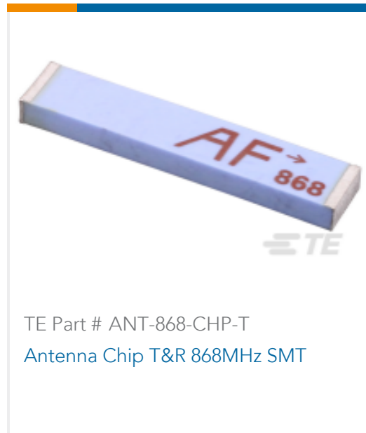
TE Part # ANT-868-CHP-T Antenna Chip T&R 868MHz SMT