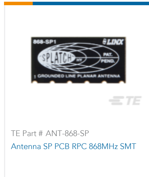
TE Part # ANT-868-SP Antenna SP PCB RPC 868MHz SMT