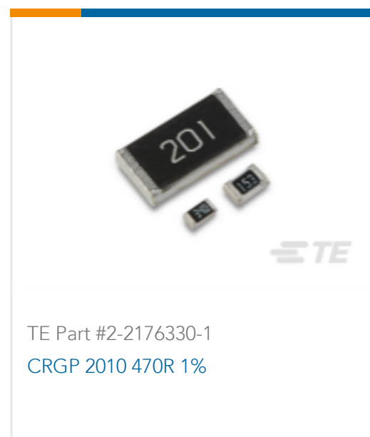
TE Part #2-2176330-1 CRGP 2010 470R 1%