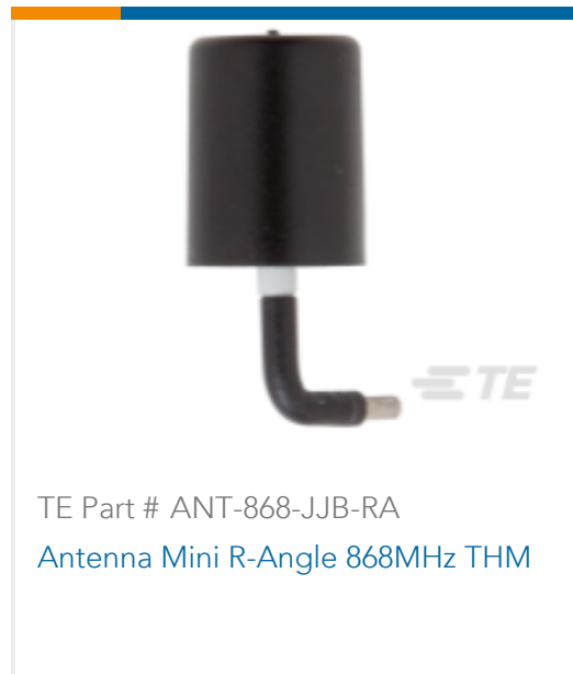
TE Part # ANT-868-JJB-RA Antenna Mini R-Angle 868MHz THM