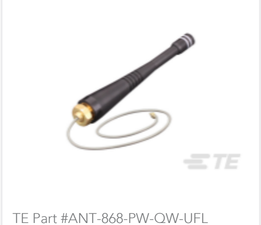
Antenna 1/4 Wave Whip 868MHz 1.32 UFL