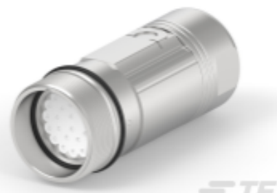
TE Part #AKA385N0059035K000 627 EXTENSION, 26-PIN