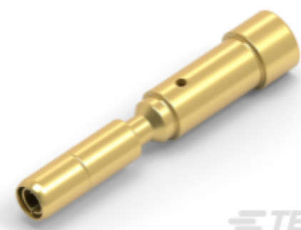
TE Part #60-0159-011-000 CONTACT SOCKET 1 MM