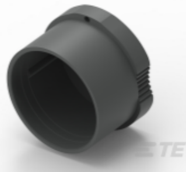
TE Part #8A-0002-000-000 623/923 PLASTIC CAP