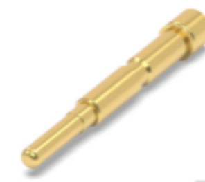
TE Part #61-0072-011-000 CONTACT PIN 1,5 MM