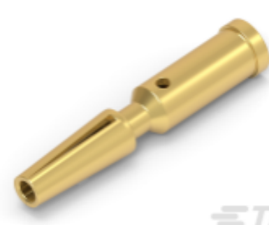
TE Part #60-0252-011-000 CONTACT SOCKET 1 MM