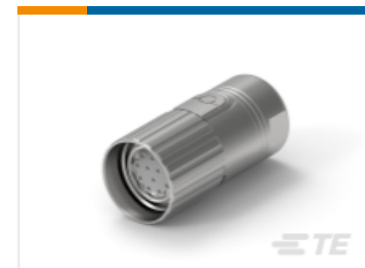
TE Part # ASA012N00620235000 623 PLUG