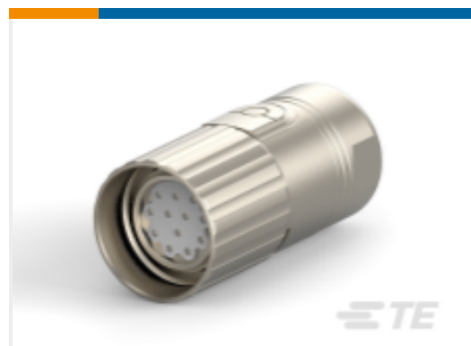
TE Part # ASA013N00620235000 623 PLUG