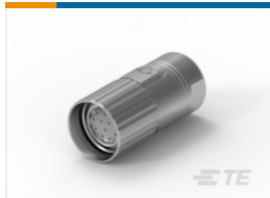
TE Part # ASA012N00390235000 623 PLUG