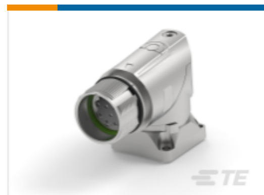
TE Part # AGC175N00001200000 623 RECEPTACLE ANGLED ROTATABLE