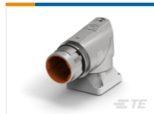
TE Part # BGC110N00001200000 923 RECEPTACLE, ANGLED, ROTATABLE