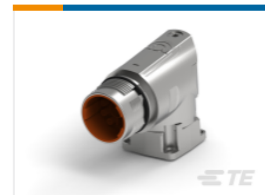
TE Part # BGC110N00001216000 923 RECEPTACLE, ANGLED, ROTATABLE