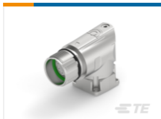
TE Part # AGC110N00001215000 623 RECEPTACLE ANGLED ROTATABLE