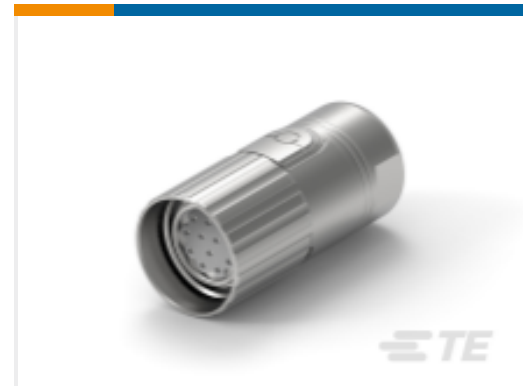
TE Part # ASA012N00410235000 623 PLUG