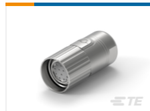
TE Part # ASA012N00410235000 623 PLUG