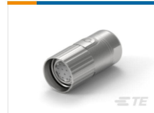
TE Part # ASA012N00730235000 623 PLUG