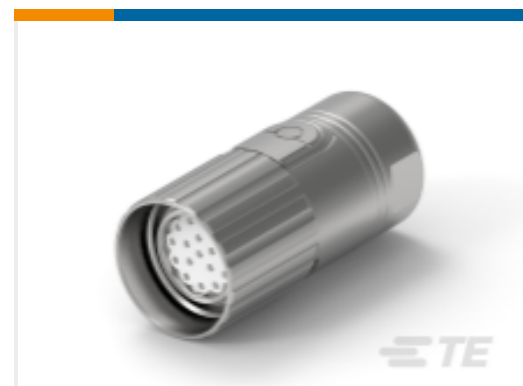
TE Part # ASA014N00620235000 623 PLUG