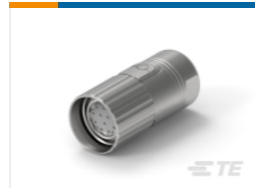
TE Part # ASA012N00620235000 623 PLUG