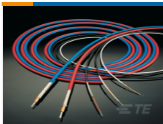
TE Part #480415-002 10599-22-9