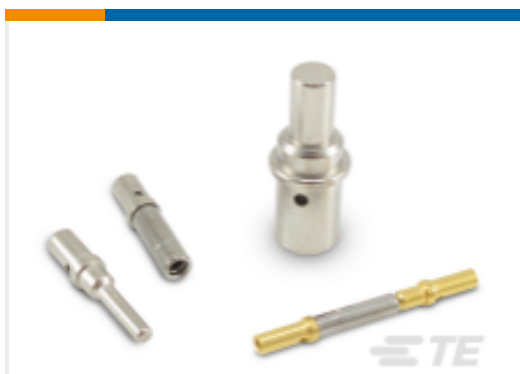
TE Part #0462-201-16141 DEUTSCH Solid Contacts