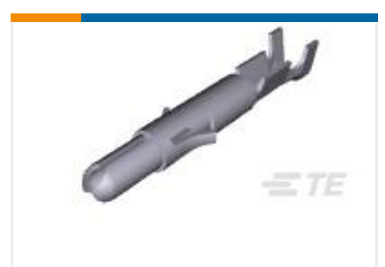
TE Part #350699-1 UMNL SPLIT PIN PTPBR