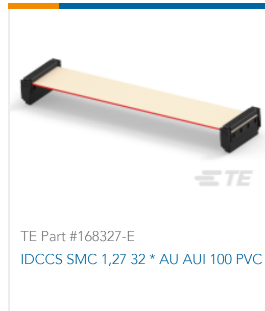
TE Part #168327-E IDCCS SMC 1,27 32 * AU AUI 100 PVC