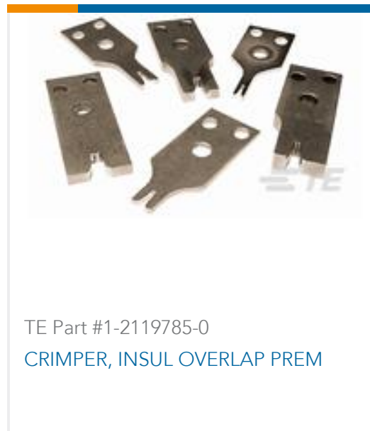
TE Part #1-2119785-0 CRIMPER, INSUL OVERLAP PREM