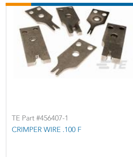
TE Part #456407-1 CRIMPER WIRE .100 F