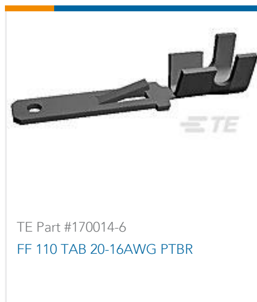
TE Part #170014-6 FF 110 TAB 20-16AWG PTBR