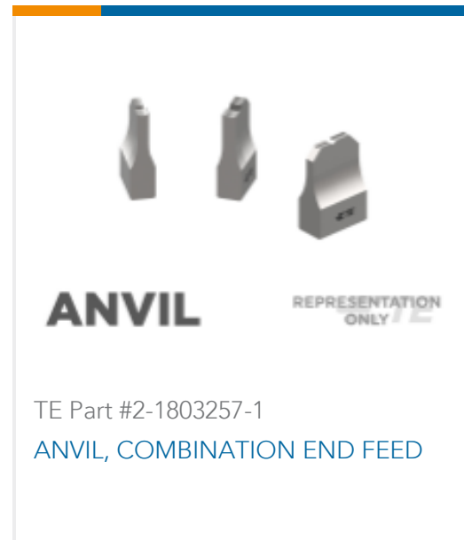
TE Part #2-1803257-1 ANVIL, COMBINATION END FEED