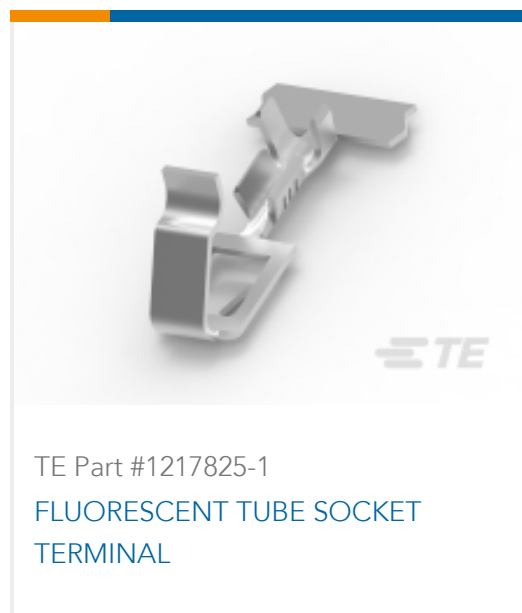
TE Part #1217825-1 FLUORESCENT TUBE SOCKET TERMINAL