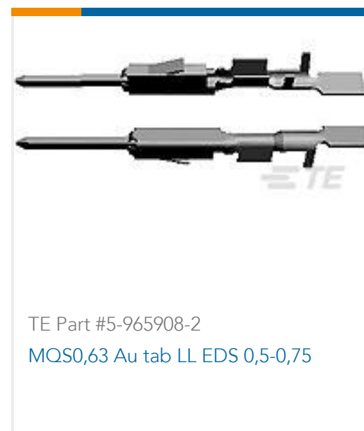
TE Part #5-965908-2 MQS0,63 Au tab LL EDS 0,5-0,75