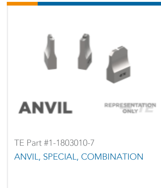
TE Part #1-1803010-7 ANVIL, SPECIAL, COMBINATION