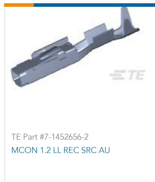
TE Part #7-1452656-2 MCON 1.2 LL REC SRC AU