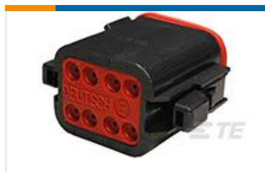
TE Part #DT06-08SB-CE06 PLG, 8P, BLK, E, SEAL RET, B