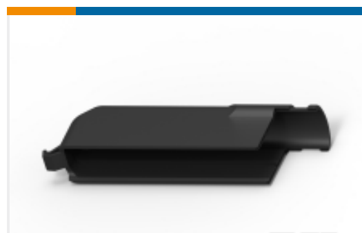
TE Part #925380-1 TIMER CONN.HSG