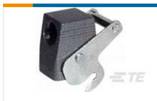
TE Part #1-1102567-3 HD-Z.40.STS-ZB.1.29