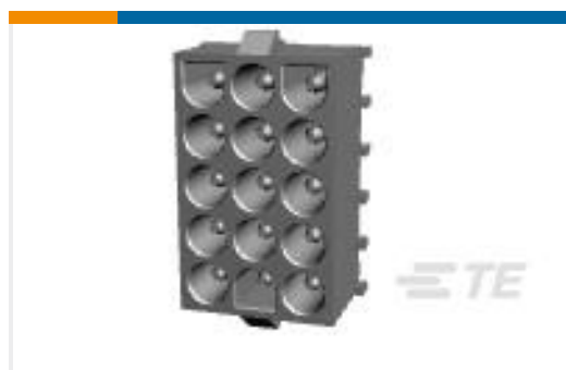
TE Part #350714-4 15P UMNL PIN HDR ASSY 94VO LF