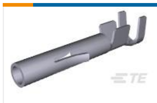
TE Part #350536-6 UMNL SOK 20-14 .0125AUNI/PHBZ