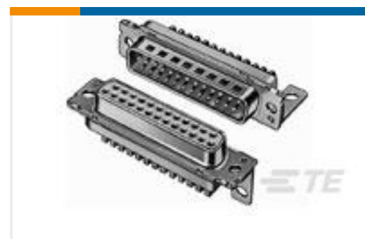
TE Part #8-1393480-7 V23529B1223C225-SUB D STIFTEI