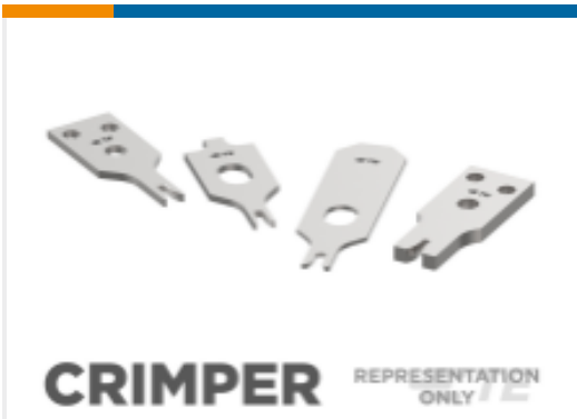
TE Part #6-1633963-1 CRIMPER, INSULATION OVERLAP PREMIUM