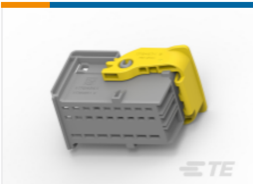
TE Part #1-1718484-2 CARRIER FOR RECEPTACLE INSERTS