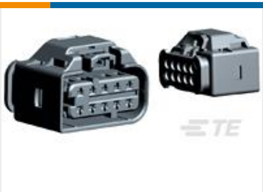
TE Part #1801600-2 RECEPTACLE HOUSING, MCON, 10 W, SEALED