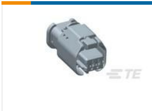
TE Part #1-1801175-6 2W RECEPTACLE HP CONNECTOR BROWN