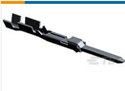
TE Part #3-1419158-1 GET MALE TERM, A, AU