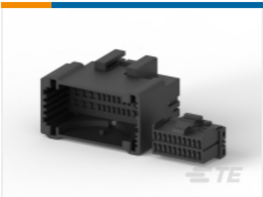
TE Part #2-936195-3 MULTILOCK, CONNECTOR HOUSING