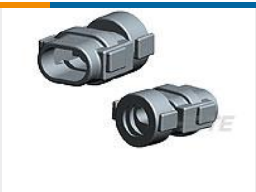
TE Part #936111-1 2.8mm Sealed 2P Cover