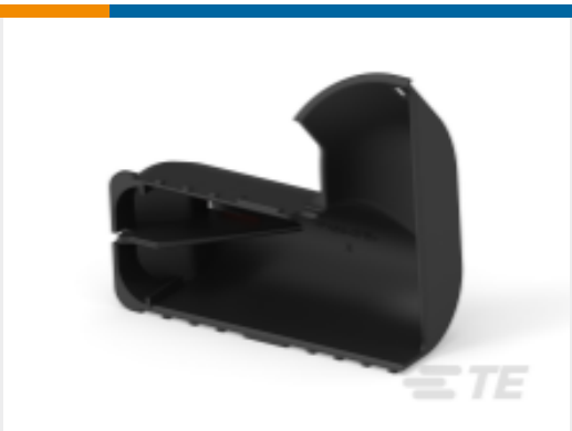
TE Part #1897428-2 COVER HSG FOR ECU 94P PLUG