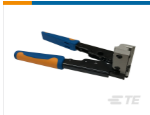
TE Part # 2305570-1 Strip Terminal Cutter-Side Feed-No Crimp