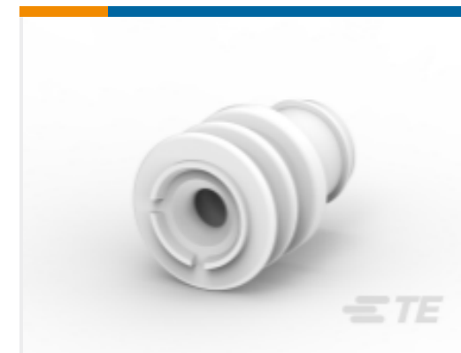
TE Part # 828905-1 SINGLE-WIRE-SEAL(5MM HOLE)