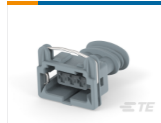
TE Part # 2137216-2 3P SPLASH PROOF CONNECTOR ASS'