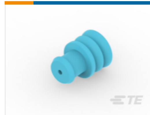
TE Part # 828904-1 SINGLE WIRE SEAL FOR J.P.T.CON