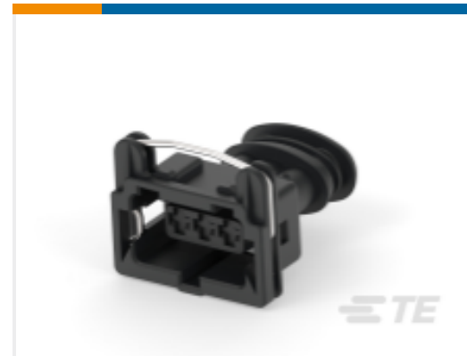
TE Part # 2137216-1 3P SPLASH PROOF CONNECTOR ASS'