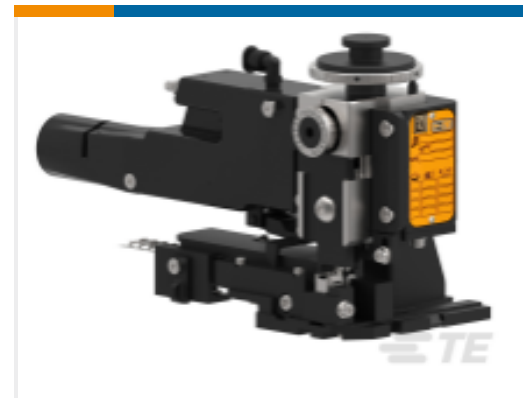
TE Part # 2151191-2 OCEAN_2.0_APPLICATOR-S-080F1600