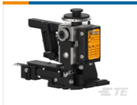
TE Part # 2151191-1 OCEAN_2.0_APPLICATOR-S-080F1600