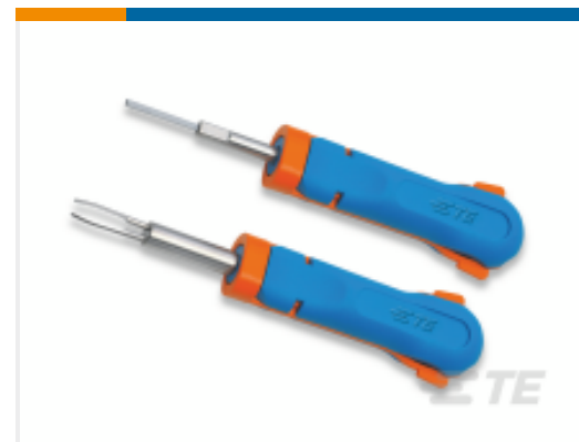
TE Part # 4-1579007-3 EXTRACTION TOOL KIT