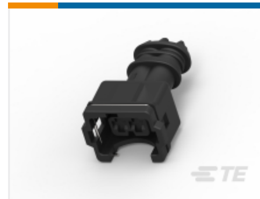
TE Part # 282648-1 SPLASH PROOF CONN. W.S.L.2 WAY