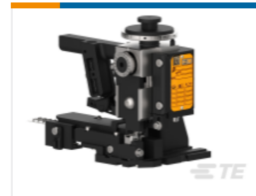
TE Part # 5-2151191-1 OCEAN_2.0_APPLICATOR-S-080F1600