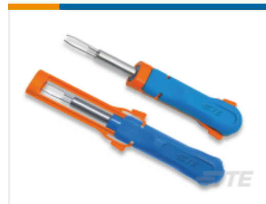
TE Part # 1-1579007-6 EXTRACTION TOOL