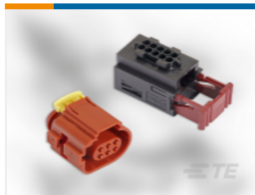
TE Part # CAT-T4827-CH8172 Timer Connector Housing