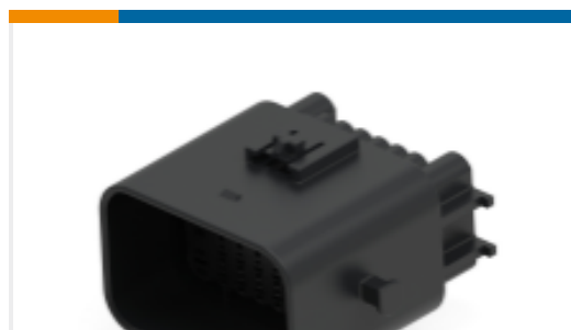
TE Part #2390416-1 TAB CONN CVR,36POS,AMP MCP 1.5 K