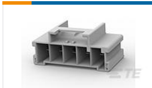
TE Part #1-1969688-5 PTL 1X5 PCB HEADER VERT HITEMP KEY A LGR