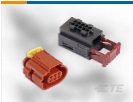
TE Part #929504-2 Timer Connector Housing