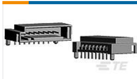
TE Part #1-1743284-2 MQS HDR 8P ASSY(H-TYPE) BLK