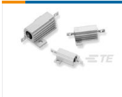
TE Part #3-1879071-3 THS50 47R 5%