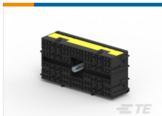
TE Part #2-936195-1 090/SPT HYB 76P PLUG ASSY