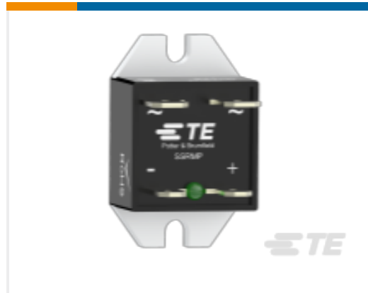
TE Part #2323802-3 SSRMP-240D10 = Mini Puck,10A,240V AC