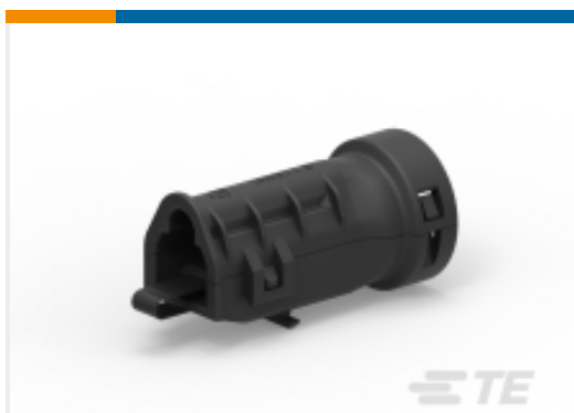
TE Part #1418917-1 MULTI CORE CABLE ADAPTER 180 DEGREE