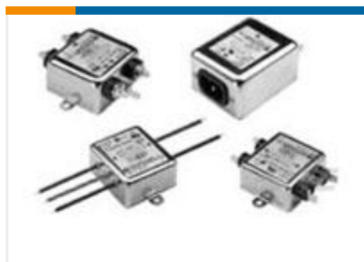
TE Part #1-6609028-0 5VK3=F7140 S0