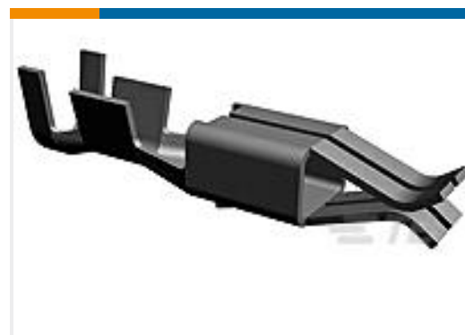
TE Part #927856-2 JPT SL REC 2.8 Contact SRC Sn