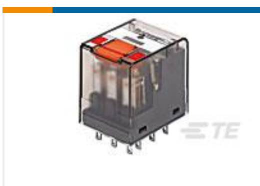
TE Part #1393154-5 PT280730