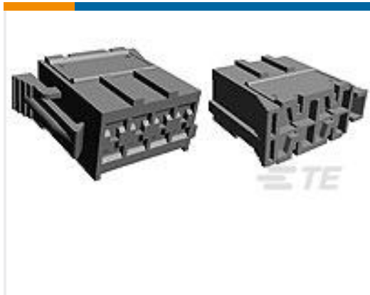
TE Part #927365-1 8P MIN D-FLACHF GEH