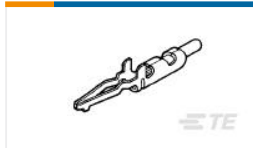
TE Part #172782-7 LOW PROFILE MINI AMP-IN