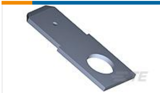
TE Part #63038-2 250 FASTON TAB BR