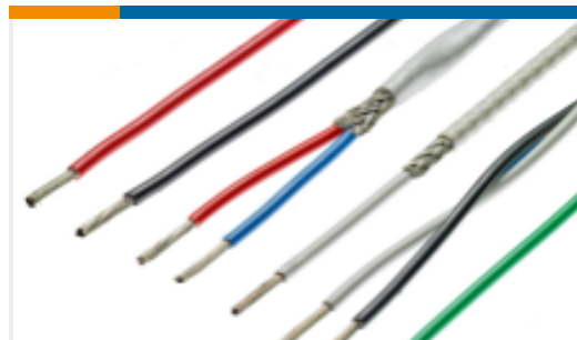
TE Part #0692813001 FLHTC0311-26-0