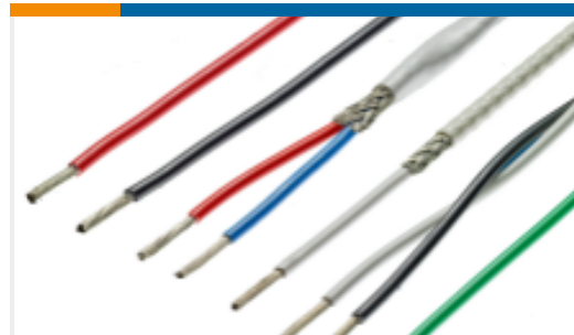
TE Part #2192653002 FLHTC0311-26-9