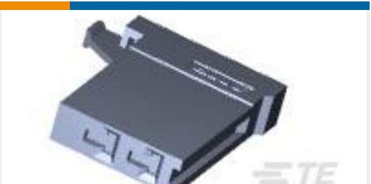
TE Part #175362-1 DYNAMIC D-3500 REC HSG 2P