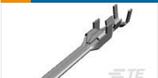
TE Part #175285-2 DYNAMIC D-3 TAB CONT. M AU 0.38