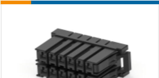
TE Part #1-179554-6 Receptacle and Tab Housing: 5.08 mm Pitch, 250-600V