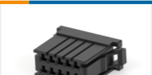
TE Part #178289-8 Receptacle and Tab Housing: 3.81 mm pitch, 250V