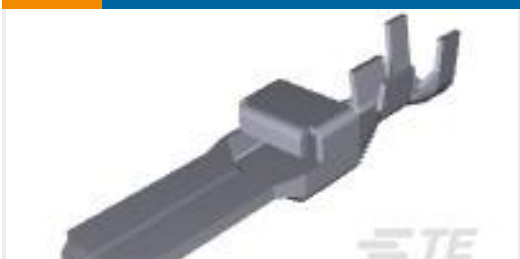
TE Part #917802-2 DYNAMIC D-5 TAB CONT. AU (S)