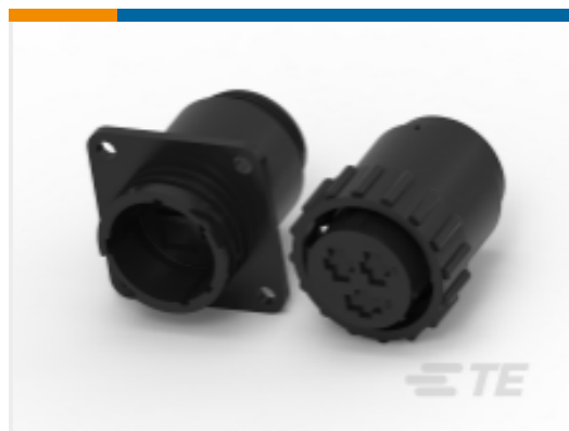
TE Part # CAT-AM71-C83998BB CPC SERIES 3