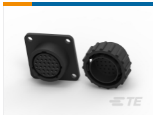
TE Part # CAT-AM71-C83998M CPC Connectors, Series 2