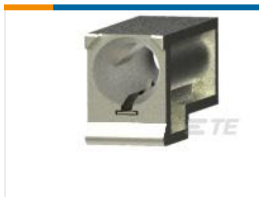
TE Part #1-1469492-2 MULTIGIG RT 9MM GUIDE/ESD 45 DEG