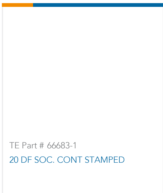
TE Part # 66683-1 20 DF SOC. CONT STAMPED