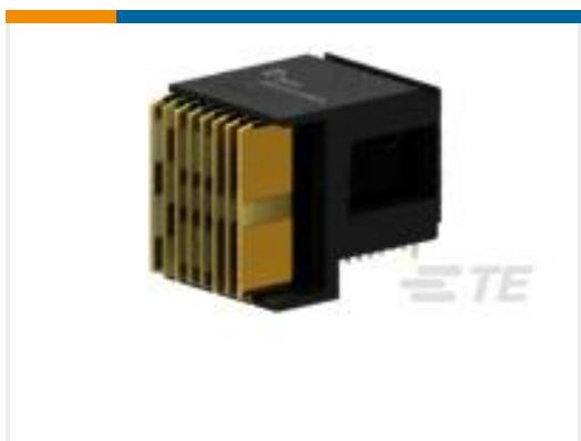
TE Part #1410189-3 MULTIGIG RT T2 7RW H-LFT,ET2