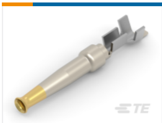
TE Part # CAT-035-DCCSC20 D-Sub Conn Contacts: Socket, Phosphor Bronze, Signal, Size 20