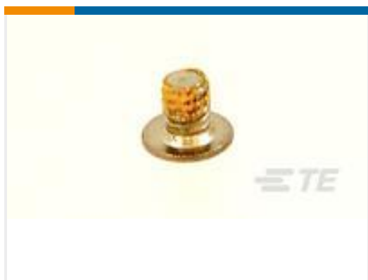
TE Part #1410946-1 MULTI-GIG SOC. CAP SCREW, CUSTOMIZED HDW