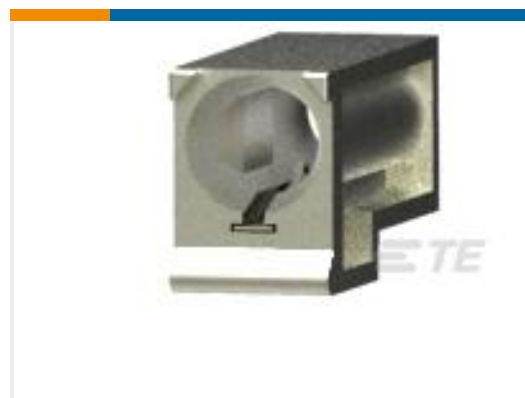
TE Part #1-1469492-3 MULTIGIG RT 9MM GUIDE/ESD 90 DEG