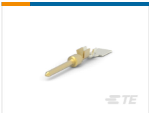
TE Part # CAT-035-DCCPB20 D-Sub Connector Contacts: Pin, Brass, Signal, Size 20