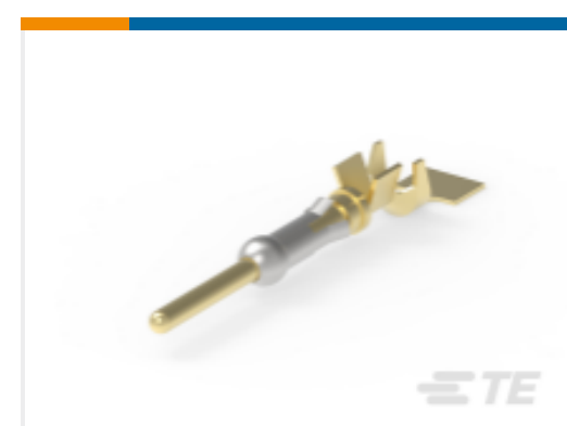
TE Part # 66602-1 III+ PIN, 18-14, TIN-LEAD, LP