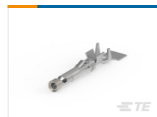
TE Part # 66598-1 III+ SKT, 18-14, TIN-LEAD, STRIP