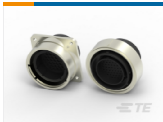
TE Part # CAT-AM71-C83998C Circular Plastic Connector, CMC Series 1