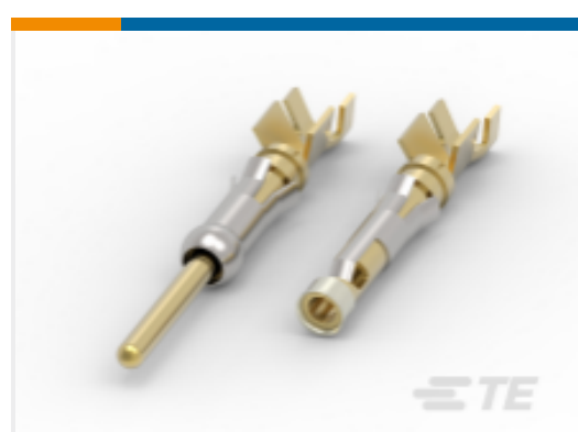
TE Part # CAT-AM71-T98G Pin and Socket Contacts, Type III, LP, High Current