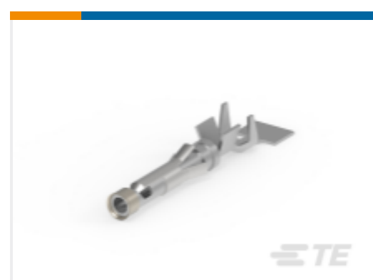
TE Part # 66601-1 III+ SKT, 18-14, TIN-LEAD, LP