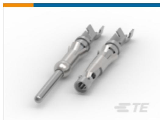
TE Part # CAT-AM71-T98E Pin and Socket Contacts, Type III, LP