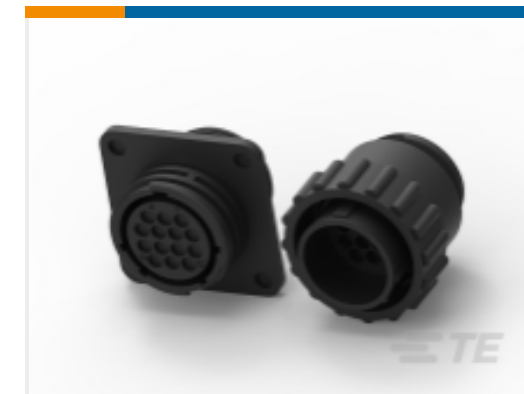
TE Part # CAT-AM71-C83998K Circular Connector, Environmentally Sealed, CPC Series 6