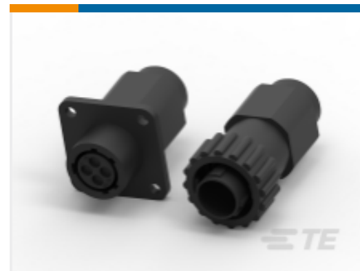
TE Part # CAT-AM71-C83998Y One-Piece Connector, Sealed, CPC Series 1