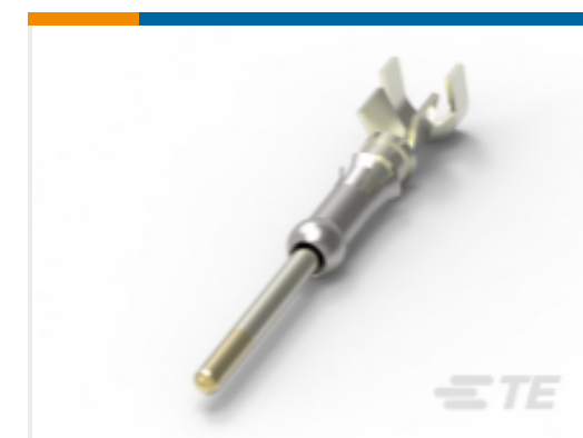
TE Part # CAT-AM71-C83998O Pin and Socket Contacts, CPC MIL-C-5015