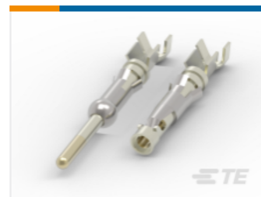
TE Part # CAT-AM71-T98B Strip Pin and Socket Contacts, Type III