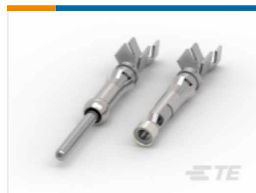
TE Part # CAT-AM71-T98F Strip Pin and Socket Contacts, Type III, High Current