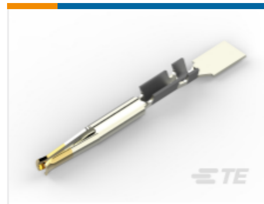
TE Part # CAT-038-DCCSC22 D-Sub Conn Contacts: Socket, Phosphor Bronze, Signal, Size 22