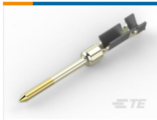
TE Part # CAT-038-DCCPB22 D-Sub Connector Contacts: Pin, Brass, Signal, Size 22