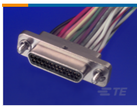
TE Part #2-1532180-0 M83513/03-B04C, MCKS-C2-B- 15P6G9-36.0