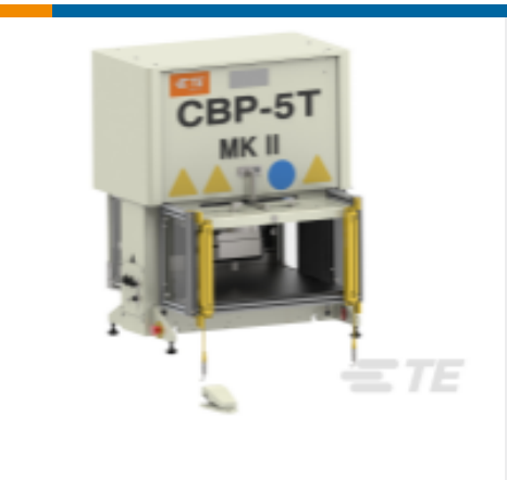
TE Part # CAT-CBP-5T CBP-5T MKII Benchtop Press - Servo Electric