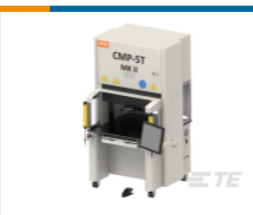
TE Part # CAT-CMP-5TMKII Connector Press Fit Machine CMP-5T MKII