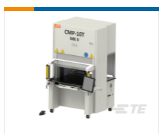
TE Part # CAT-CMP-10TMKII Connector Press Fit Machine