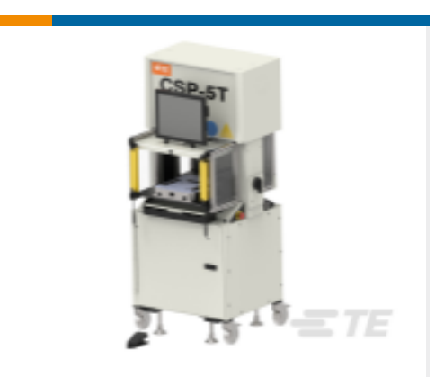
TE Part # CAT-CSP-5T CSP-5T MKII Shuttle Electric Press Machine