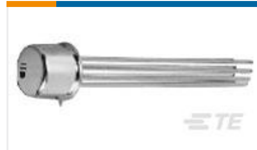
TE Part #3-1617118-1 J1MACDD-26XM = M39016/24-030M