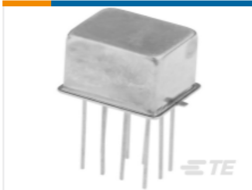
TE Part #9-1617591-5 JMGAT-18MW=M28776/6-011M