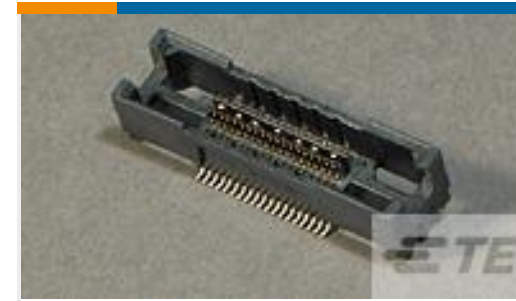
TE Part #2-767004-2 MICT,RECPT,038,ASSY,.025,REC