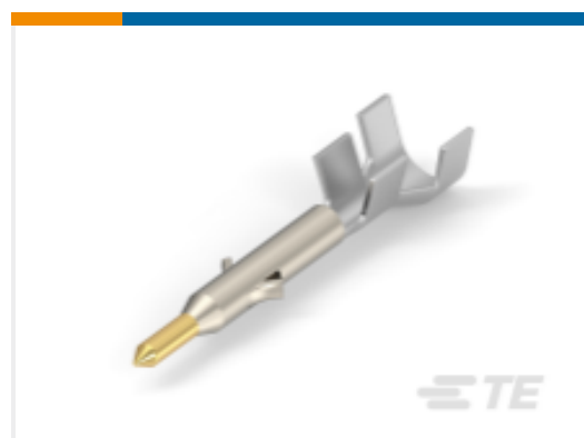
TE Part # 794406-3 MINI UMNL CONT 20-16AWG AU