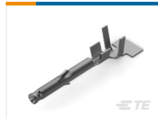
TE Part # 171639-1 MINI U-M-N-L SOCKET L.P