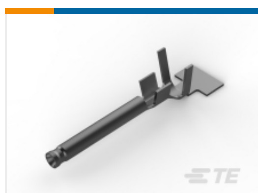
TE Part # 171637-1 MINI U-M-N-L SOCKET CONTACT