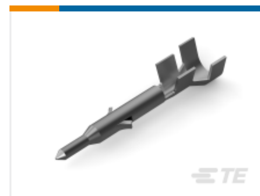
TE Part # 794406-1 MINI UMNL CONT 20-16AWG SN