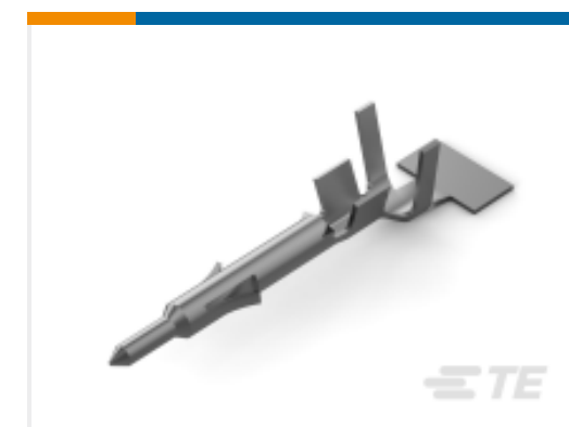
TE Part # 171636-1 MINI U-M-N-L PIN CONTACT