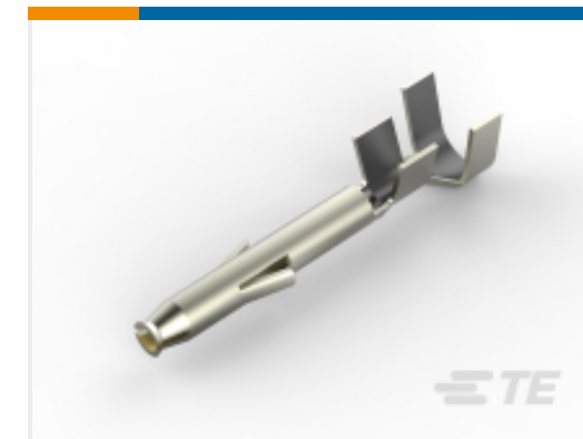
TE Part # 1-794407-0 MINI UMNL SOK 20-16 AWG AU LF