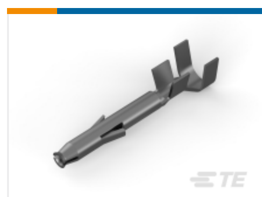
TE Part # 794407-4 MINI UNML SCKT 20-16 AWG SN