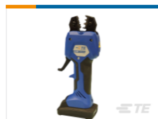
TE Part # 2280380-1 KIT, BT, MICRO SDE, 110V