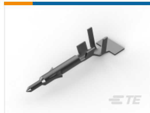
TE Part # 171638-1 MINI U-M-N-L PIN CONT. L.P