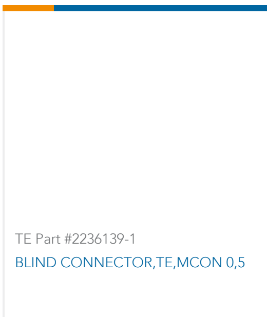
TE Part #2236139-1 BLIND CONNECTOR,TE,MCON 0,5