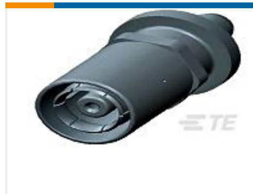
TE Part #1924937-1 PLUG SUBASSEMBLY, RG174, FAKRA