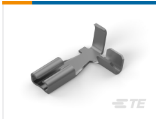
TE Part #928884-2 110 FASTON FLAG REC 22-18 AWG BR