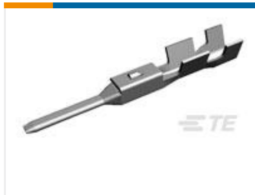
TE Part #917309-1 MINI MLC CONN. TAB CONT.