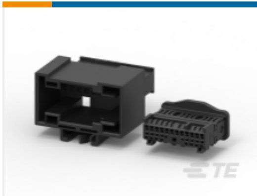
TE Part #9-965382-2 MQS, CONNECTOR HOUSING