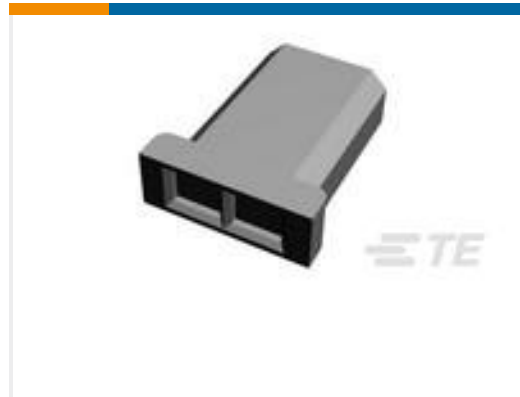
TE Part #925015 FF 110 REC HSG 3P NYLON NAT