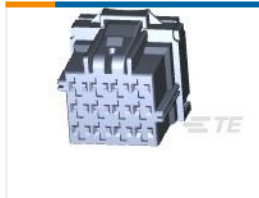
TE Part #5-968972-1 AMP MCP 2.8 HSG 12POS. 2.LOCKING