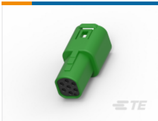
TE Part #2822344-1 MINI MLC CAP HSG ASSY 7P