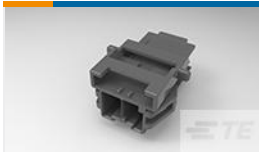
TE Part #5-2232263-2 PTL 1X2 CAP PANEL MT GLW WIRE KEY A DGR