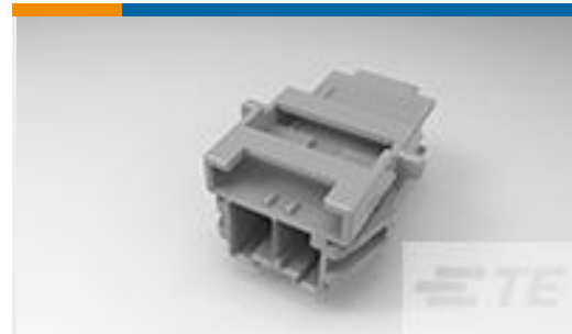
TE Part #5-1971772-2 PTL 1X2 CAP PANEL MT HITEMP KEY A LGR