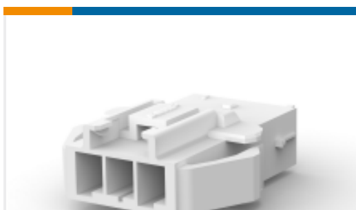
TE Part #5-177907-1 POWER DBL LOCK CAP P/M 3P(GWT)