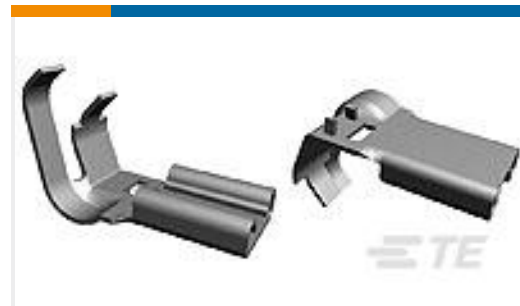
TE Part #41532 250 FASTON FLAG REC 18-12 AWG TPBR