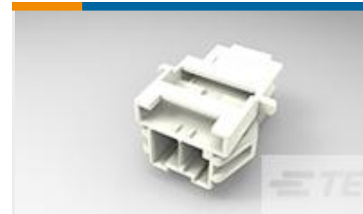
TE Part #1-1971772-2 PTL 1X2 CAP PANEL MT STD TEMP KEY A NAT