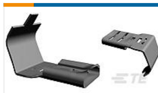
TE Part #62011-1 250 FASTON FLAG REC 12-10 AWG BR