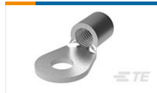
TE Part #2-31811-5 TERMINAL, SOLIS R 4 1/4