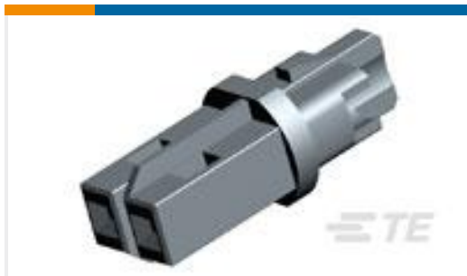
TE Part #293388-3 NECTOR S PLUG HV-4 WHITE