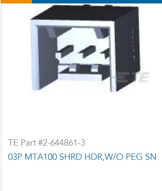
TE Part #2-644861-3 03P MTA100 SHRD HDR,W/O PEG SN