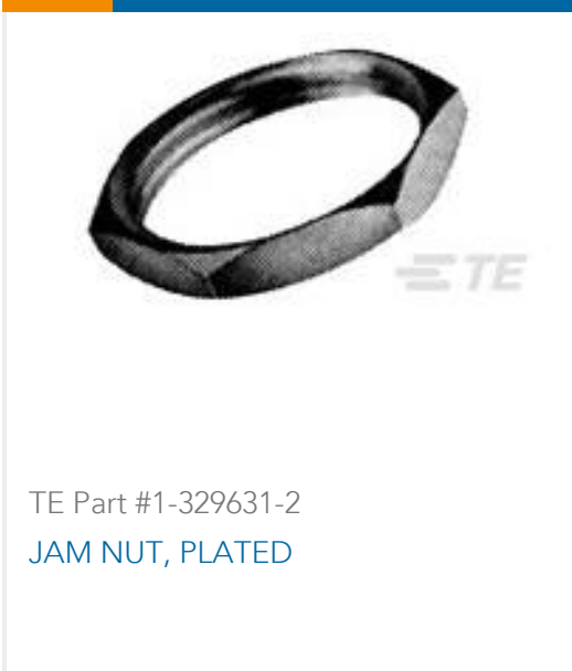
TE Part #1-329631-2 JAM NUT, PLATED