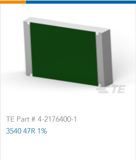
TE Part # 4-2176400-1 3540 47R 1%