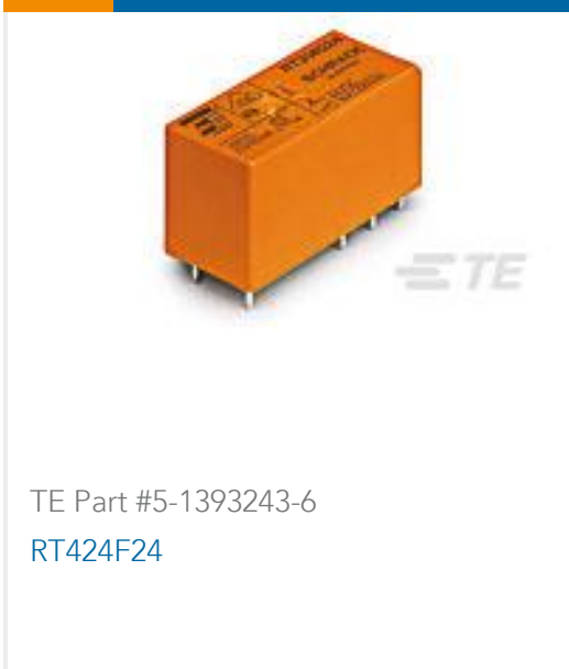
TE Part #5-1393243-6 RT424F24