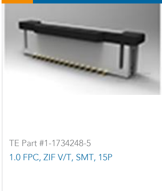
TE Part #1-1734248-5 1.0 FPC, ZIF V/T, SMT, 15P