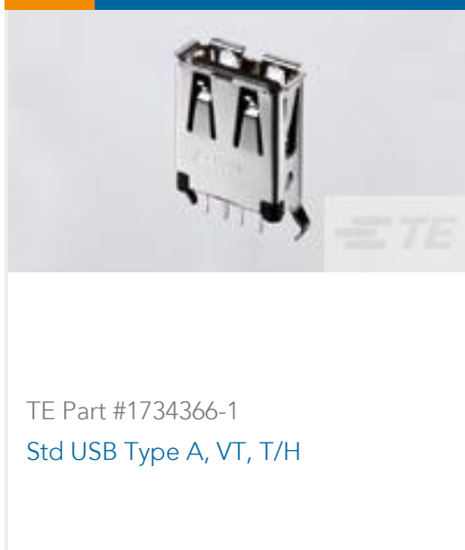
TE Part #1734366-1 Std USB Type A, VT, T/H