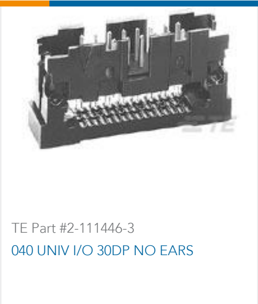
TE Part #2-111446-3 040 UNIV I/O 30DP NO EARS