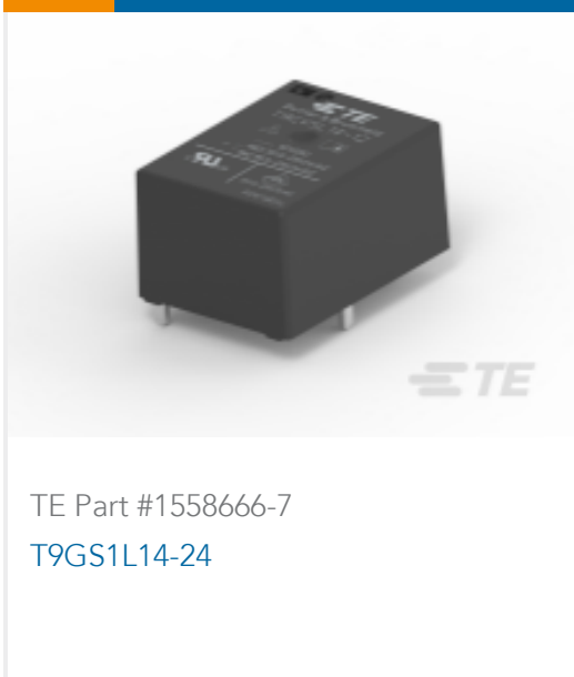
TE Part #1558666-7 T9GS1L14-24