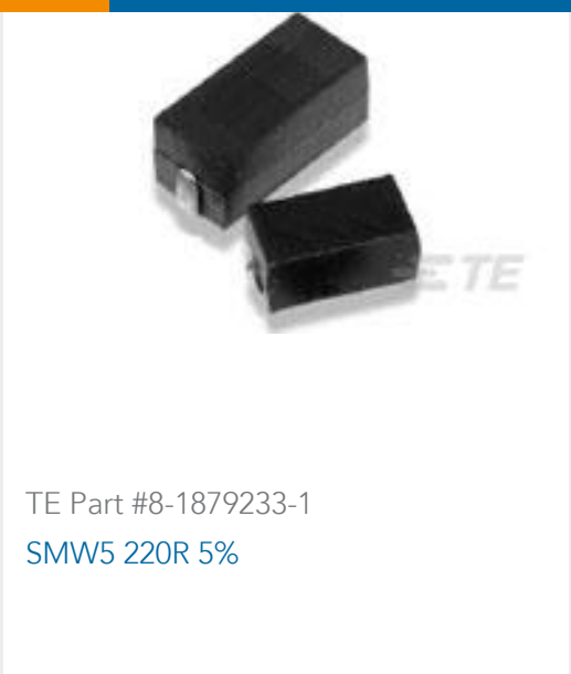
TE Part #8-1879233-1 SMW5 220R 5%