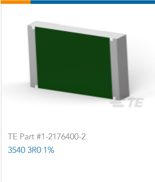
TE Part #1-2176400-2 3540 3R0 1%