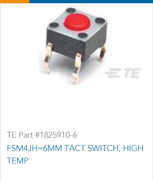
TE Part #1825910-6 FSM4JH=6MM TACT SWITCH, HIGH TEMP