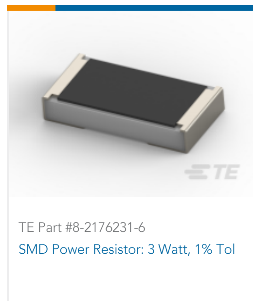
TE Part #8-2176231-6 SMD Power Resistor: 3 Watt, 1% Tol