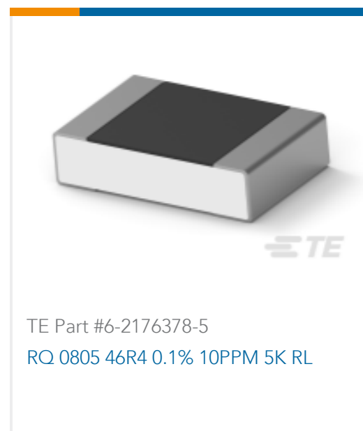
TE Part #6-2176378-5 RQ 0805 46R4 0.1% 10PPM 5K RL