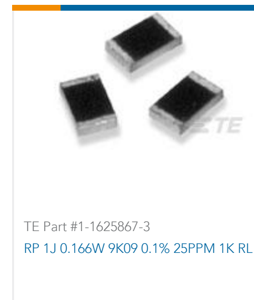
TE Part #1-1625867-3 RP 1J 0.166W 9K09 0.1% 25PPM 1K RL