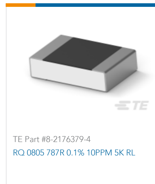
TE Part #8-2176379-4 RQ 0805 787R 0.1% 10PPM 5K RL