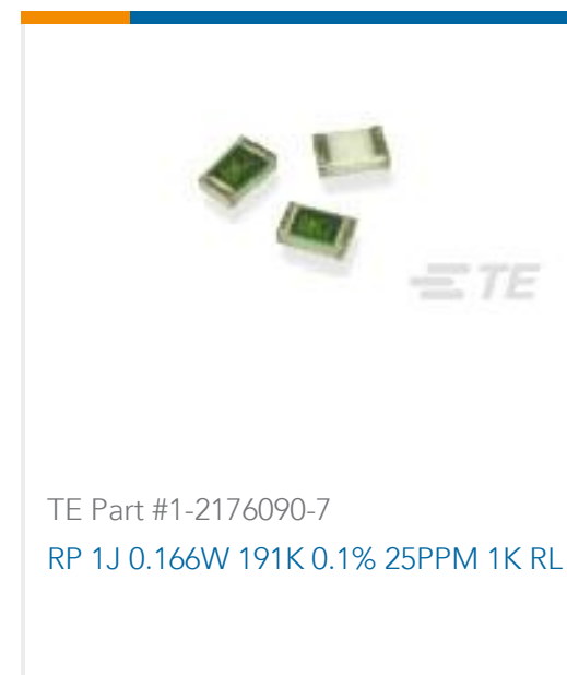
TE Part #1-2176090-7 RP 1J 0.166W 191K 0.1% 25PPM 1K RL