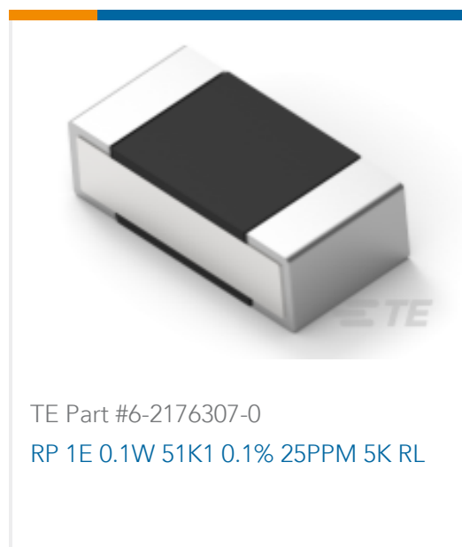
TE Part #6-2176307-0 RP 1E 0.1W 51K1 0.1% 25PPM 5K RL