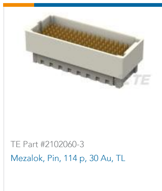
TE Part #2102060-3 Mezalok, Pin, 114 p, 30 Au, TL