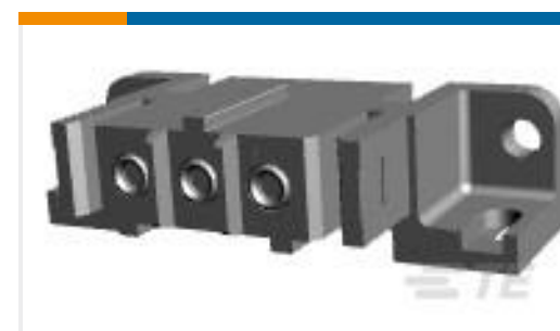
TE Part #207609-7 SKT HDR ASSY,3P,MMATE LF