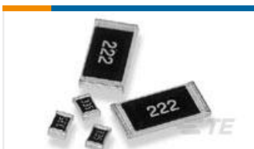
TE Part #5-1879501-9 CRGH2512 5% 270R 2W