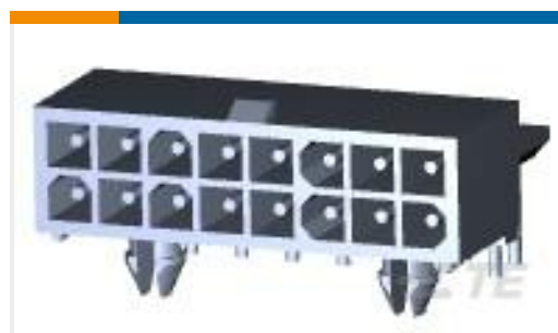
TE Part #1-770974-1 16P MINI UMNL R/A HDR ASSY LF