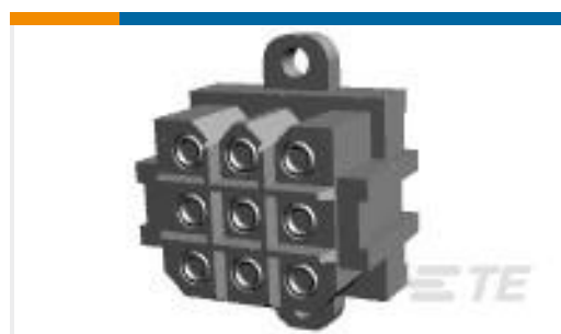
TE Part #207526-9 SKT HDR ASSY,9P,MMATE LF