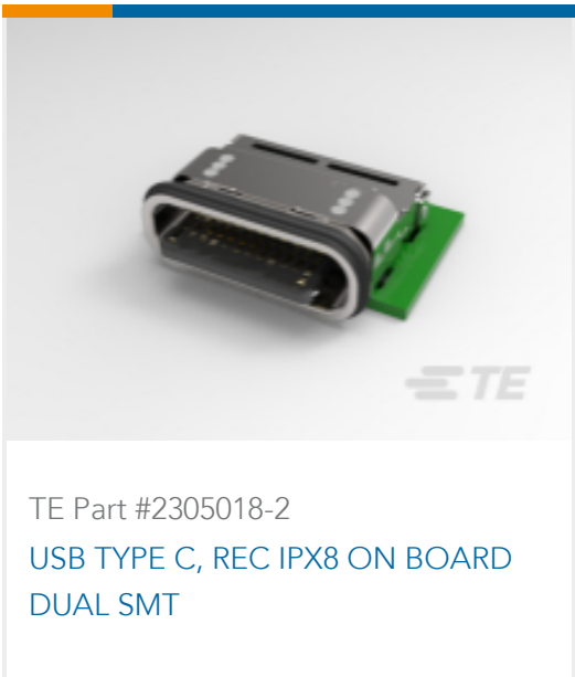
TE Part #2305018-2 USB TYPE C, REC IPX8 ON BOARD DUAL SMT