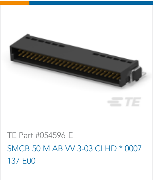
TE Part #054596-E SMCB 50 M AB VV 3-03 CLHD * 0007 137 E00