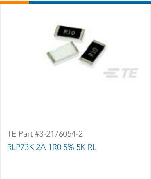
TE Part #3-2176054-2 RLP73K 2A 1R0 5% 5K RL