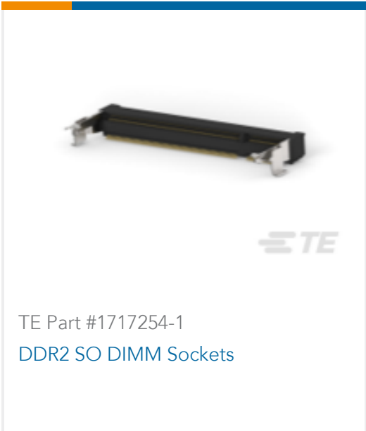
TE Part #1717254-1 DDR2 SO DIMM Sockets