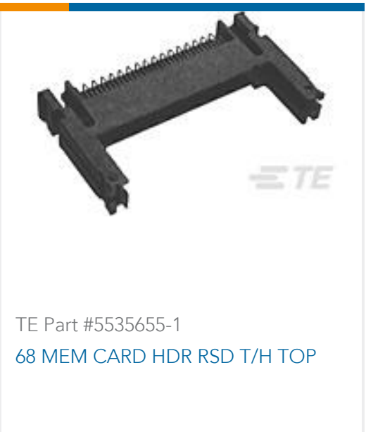
TE Part #5535655-1 68 MEM CARD HDR RSD T/H TOP