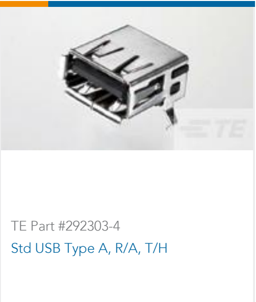
TE Part #292303-4 Std USB Type A, R/A, T/H