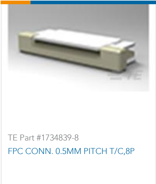
TE Part #1734839-8 FPC CONN. 0.5MM PITCH T/C,8P