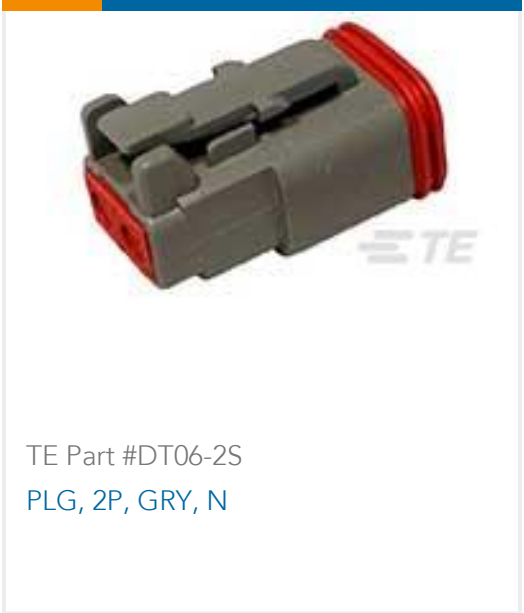
TE Part #DT06-2S PLG, 2P, GRY, N