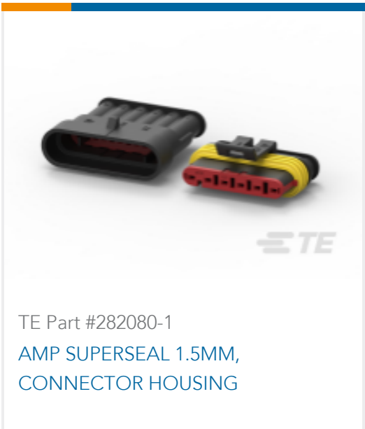
TE Part #282080-1 AMP SUPERSEAL 1.5MM, CONNECTOR HOUSING