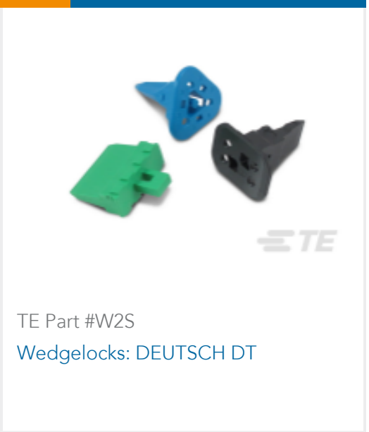
TE Part #W2S Wedgelocks: DEUTSCH DT