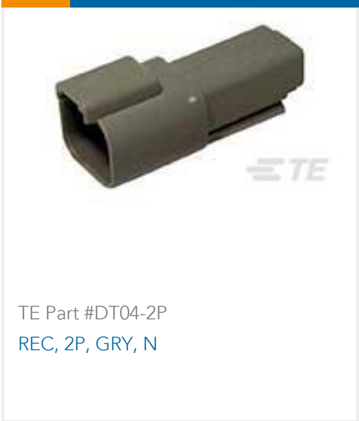
TE Part #DT04-2P REC, 2P, GRY, N