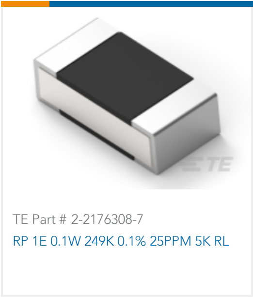
TE Part # 2-2176308-7 RP 1E 0.1W 249K 0.1% 25PPM 5K RL