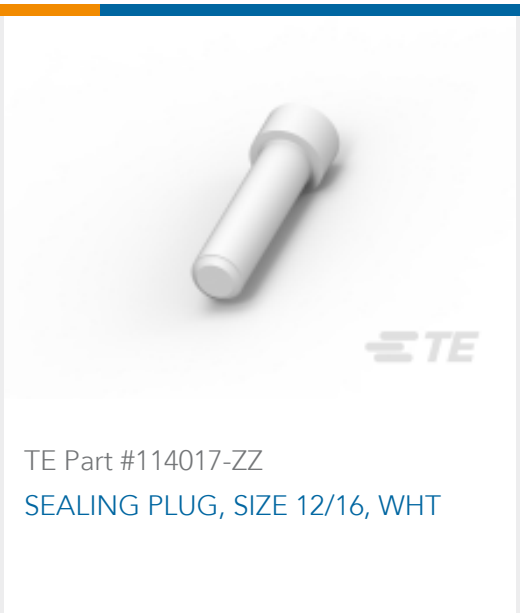
TE Part #114017-ZZ SEALING PLUG, SIZE 12/16, WHT