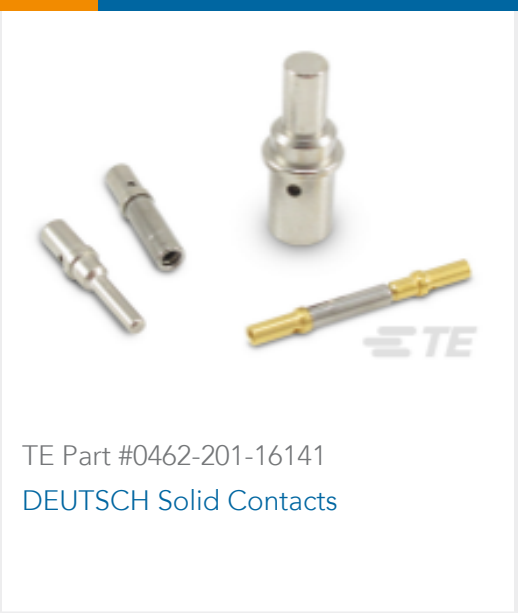
TE Part #0462-201-16141 DEUTSCH Solid Contacts