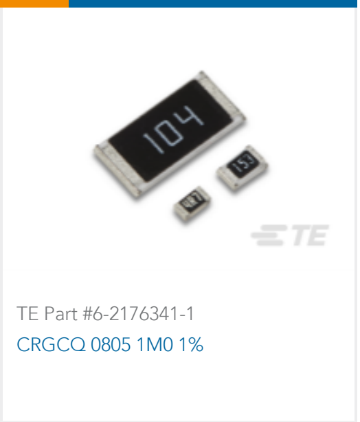
TE Part #6-2176341-1 CRGCQ 0805 1M0 1%