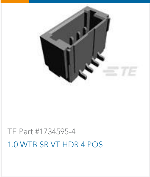
TE Part #1734595-4 1.0 WTB SR VT HDR 4 POS