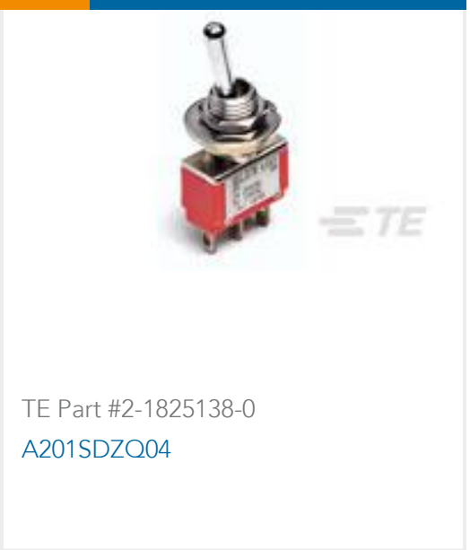
TE Part #2-1825138-0 A201SDZO04