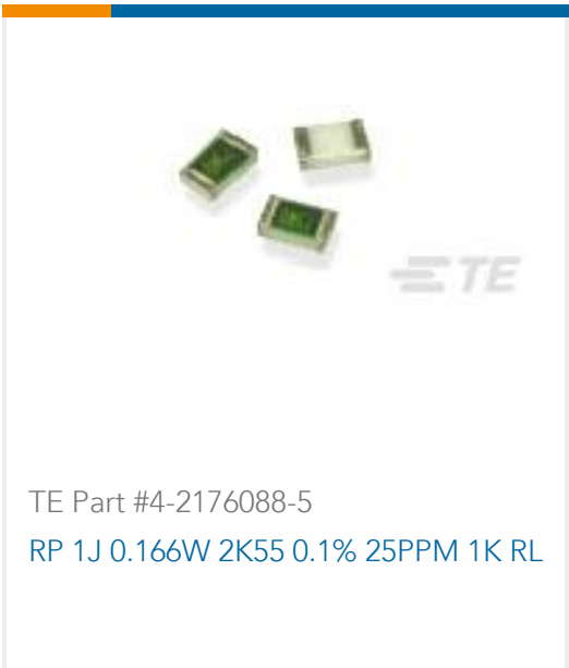
TE Part #4-2176088-5 RP 1J 0.166W 2K55 0.1% 25PPM 1K RL