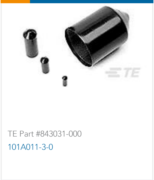
TE Part #843031-000 101A011-3-0