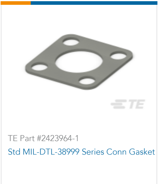
TE Part #2423964-1 Std MIL-DTL-38999 Series Conn Gasket