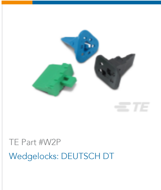
TE Part #W2P WedgeLocks: DEUTSCH DT