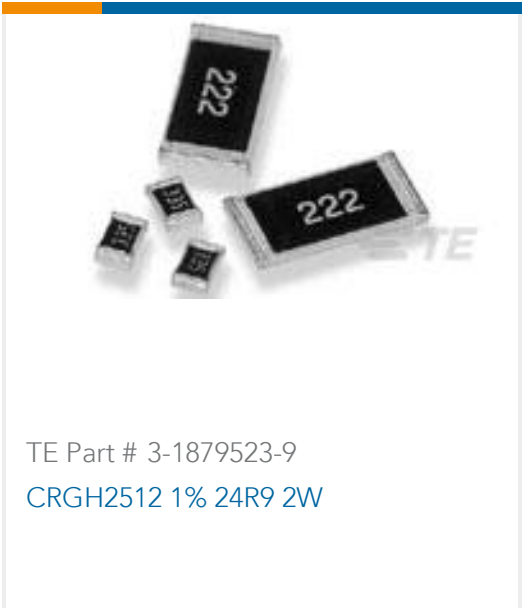
TE Part # 3-1879523-9 CRGH2512 1% 24R9 2W