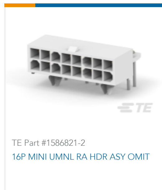
TE Part #1586821-2 16P MINI UMNL RA HDR ASY OMIT