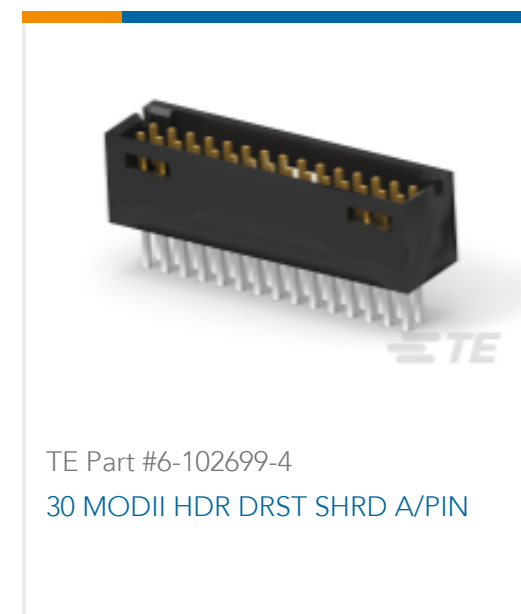
TE Part #6-102699-4 30 MODII HDR DRST SHRD A/PIN