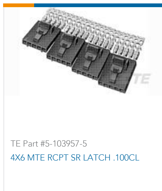
TE Part #5-103957-5 4X6 MTE RCPT SR LATCH .100CL