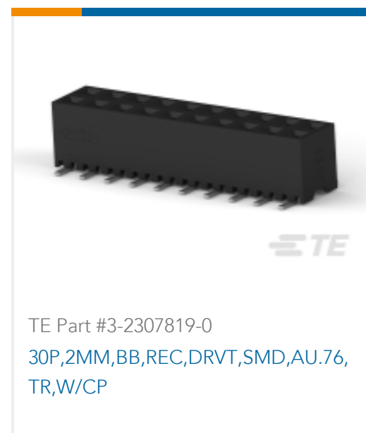
TE Part #3-2307819-0 30P,2MM,BB,REC,DRVT,SMD,AU.76, TR,W/CP