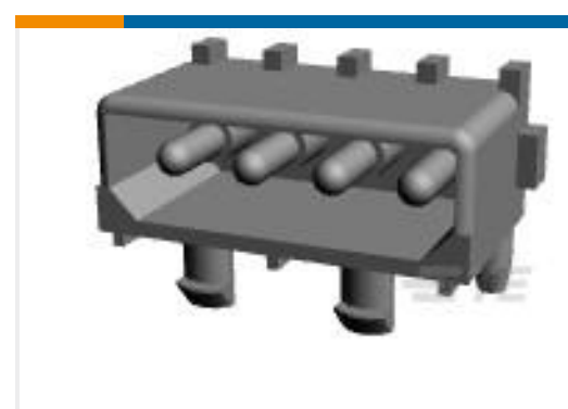
TE Part #827001-2 4P MNL STIFTSOCKEL