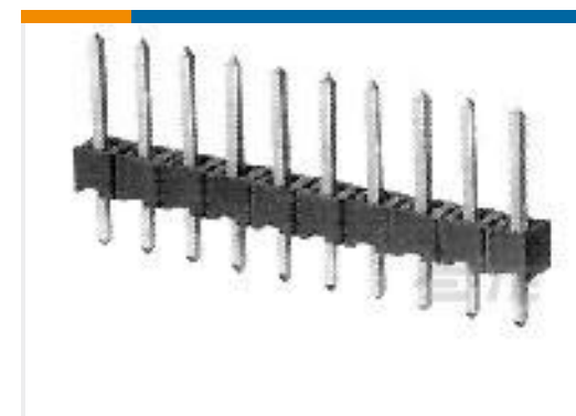
TE Part #826646-2 AMP MODU II R/A HEADER