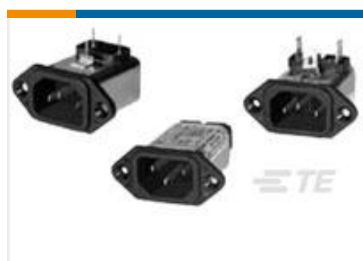
TE Part #1-6609000-1 10EEA2=F7531G S0