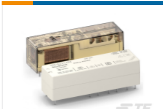
TE Part #1393260-7 Force Guided Relay with 6 contacts