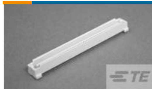
TE Part #5177986-4 0.8FH,P05H.5,100,08/Sn,TR,SC