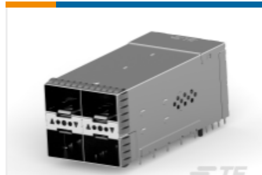
TE Part #3-2343522-3 SFP56 STACKED 2X2 RECEPTACLE ASSEMBLY