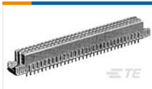
TE Part #5536397-5 ASSY,RECEPT,EURO,TYPE C/2,LEAD