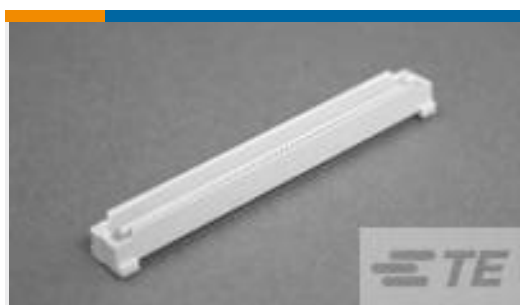
TE Part #5177986-2 0.8FH,P05H.5,060,08/Sn,TR,SC