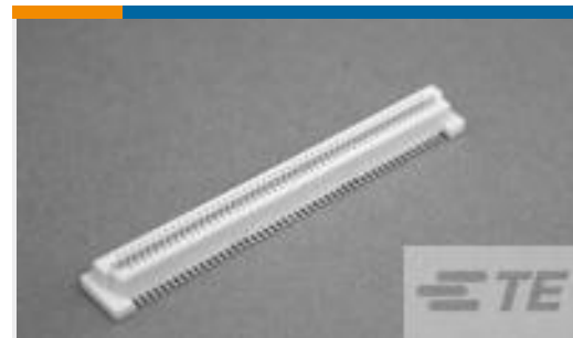
TE Part #5177983-2 0.8FH,R05H.5,060,08/Sn,TU