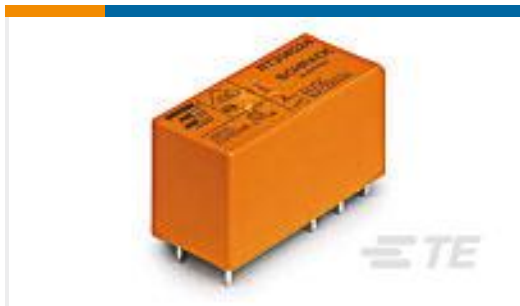
TE Part #7-1393243-0 RT424048