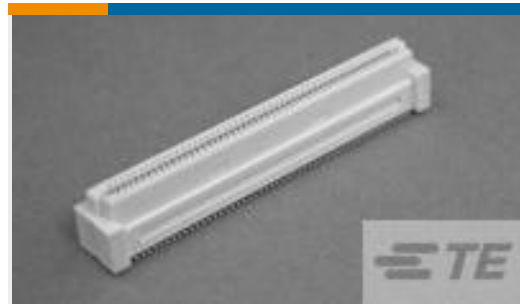
TE Part #5-5179180-4 0.8FH,R09H.5,100,08/Sn,TR,SC