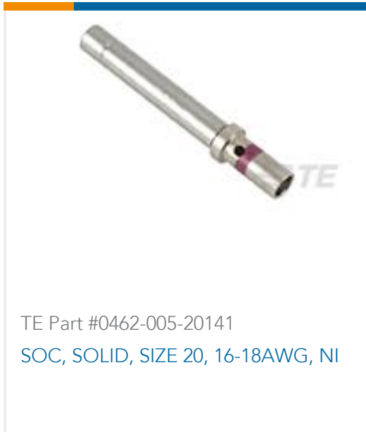
TE Part #0462-005-20141 SOC, SOLID, SIZE 20, 16-18AWG, NI