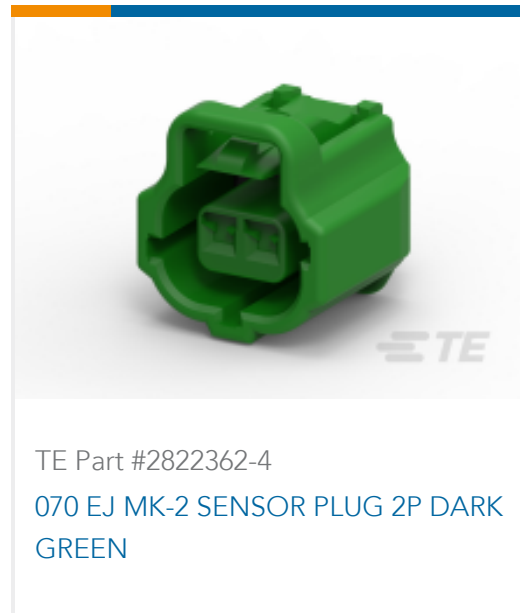
TE Part #2822362-4 070 EJ MK-2 SENSOR PLUG 2P DARK GREEN