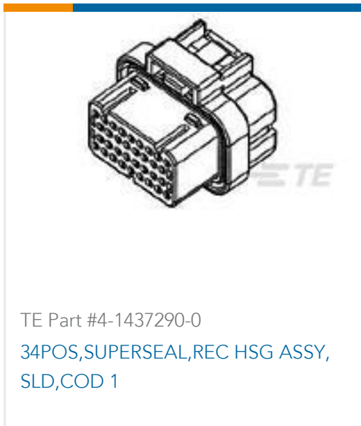
TE Part #4-1437290-0 34POS,SUPERSEAL,REC HSG ASSY, SLD,COD 1