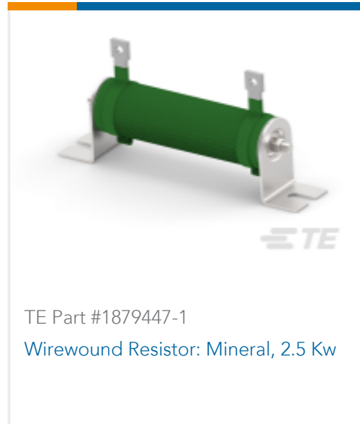
TE Part #1879447-1 Wirewound Resistor: Mineral, 2.5 Kw