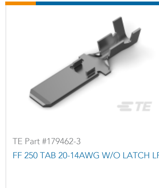
TE Part #179462-3 FF 250 TAB 20-14AWG W/O LATCH LP