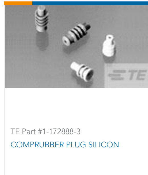
TE Part #1-172888-3 COMPRUBBER PLUG SILICON